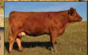
KIMLAKE NETTIE 851U Dam of Lot 63