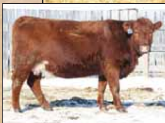
EDN UNITA 123U Dam of Lot 12