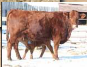
EDN PIXIE 78P Dam of Lot 31 and Granddam of Lot 32

Very dark red, thick made, easy fleshing with large testicles. He is a good footed bull with black hooves. As quiet as any bull in the pen. His dam is a very good cherry red cow that has been admired by visitors. Some outcross genetics with EDN Leo & Limited Black in her pedigree. This cow is also the Granddam of 132X. Two daughters were put back into our herd.