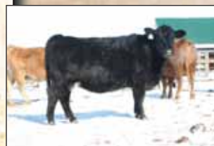
EDN SATIN 150S Dam of Lot 14

47X, the only Red Texas son we are offering could be the most complete black we have raised. As thick topped and deep bodied as they come. Easy going, big correct feet, large testicles and he moves like a cat. I don't know where I would change him. We would like to reserve the right to draw semen for use in our herd at our expense and your convenience.