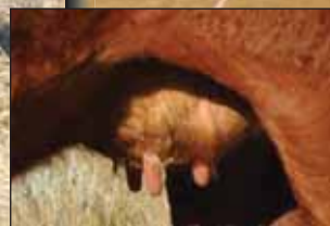
Dam's udder 2010