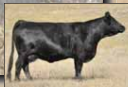
KIMLAKE ABRICOT 511R Dam of Lot 65 and maternal sister to Lot 66