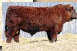
VIRGINIA RED TEXAS Sire of Lot 14