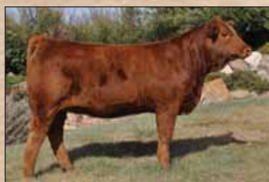
Boundary Renata 3W Granddaughter of 20R sold at Agribition

FR RESULT Sire: KS BRAVADO P68 RIV RED BRIGADIA 969J PRL MAVERICK 266M Dam: TEMPLEHALL RENATA 20R TEMPLEHALL KARI 6K