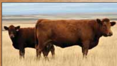
Renata 20R with her 2009 heifer calf

19X & 20X are twin brothers out of the Renata cow family; both are very docile and have a lot to offer but they definitely are not identical. 19X is smooth made, moderate, stylish, and perfectly balanced. He was raised by a two year old Angus heifer that did a heck of a job, but had a tough time competing with Renata 20R who has tons of milk. 20X indexed 104.6 for WW and 105.8 for YW. He is a big performance bull with lots of length, width, and muscling. Renata 20R is the Grand Dam of the heifer we sold at the Agribition Sale in 2009 to Tessier's, also sired by Bravado. Pick style, performance or both – whatever you choose, we're sure you'll be happy with a Renata son.