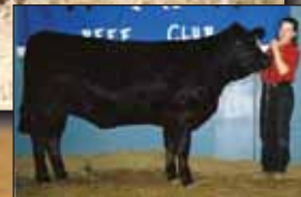
EDN MINNIE 46M as a yearling Dam of Lot 24