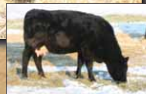
EDN JINX 72J at 12 years of age Dam of Lot 16 and Granddam of Lot 17