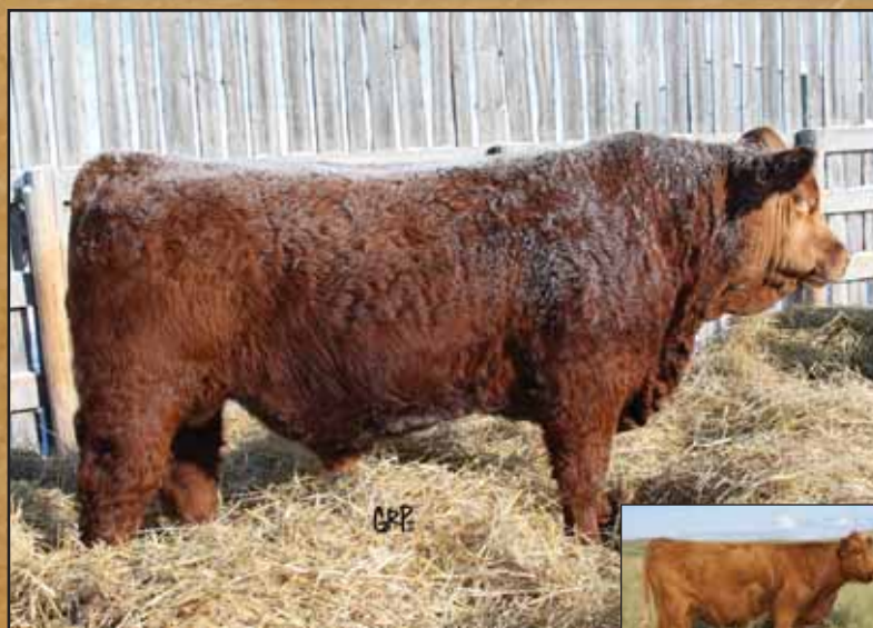
CALICO RORIE 540R Dam of Lot 4

Here is a bull with lots of power, yet very clean and smooth up front. We are very happy with our Unified calves. All dark red, smooth shouldered with great hair and lots of middle. His mother is a real front pasture cow; deep bodied, feminine, with tons of rib and eye appeal. This bull reminds us a lot of a maternal brother that sold to Pat Perrault in last year's sale. The thickness and style of this bull will make for a very appealing package for many cattle producers.