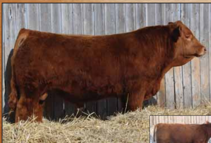
KIMLAKE MARIE 840U Dam of Lot 61