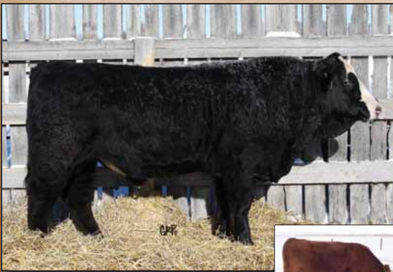
TPP CROCUS NADINE 5N Dam of Lot 6