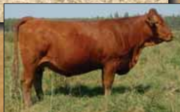
Kimlake Red Doll 6555 Grand Dam of Lot 58