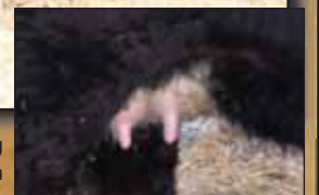
BOUNDARY SILKY SARAH 6U Picture of udder quality of dam