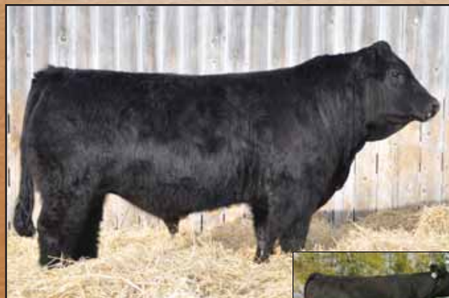
KIMLAKE ABRICOT 356N Dam of Lot 66 and Grand Dam of Lot 65

HETEROZYGOUS POLLED/Scurred – HOMOZYGOUS BLACK