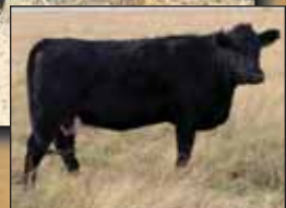
TSZ ADARA 206U Dam of Lot 33