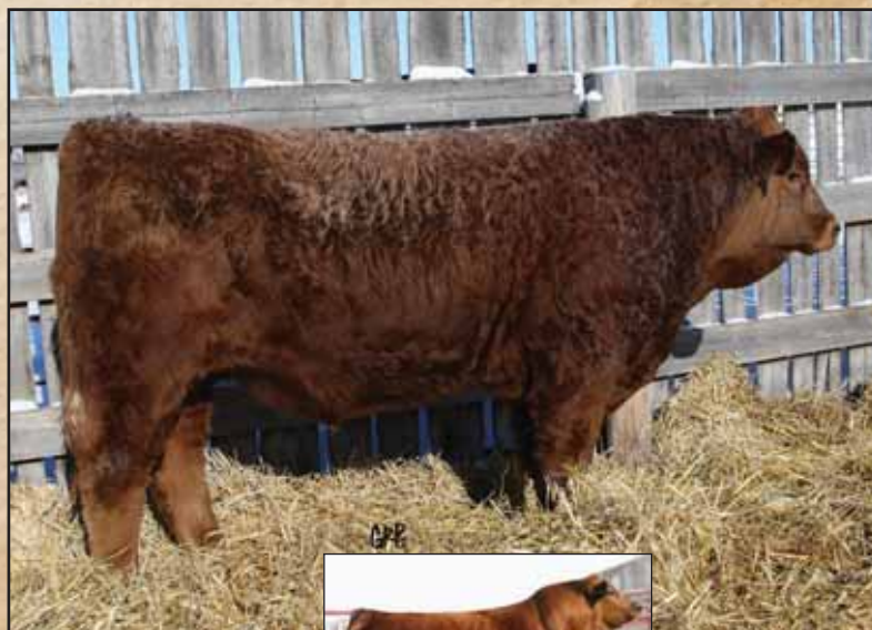
THSF FREEDOM 300N Sire of Lots 2 & 3