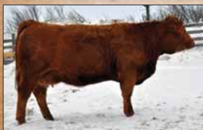
Boundary Renata 3T Maternal Sister to Lots 59 & 60