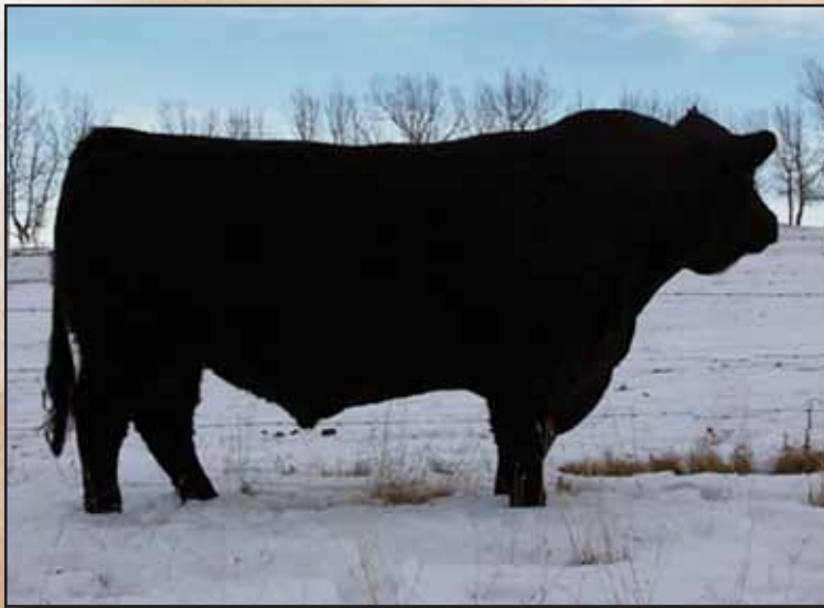
IPU BLACK HEAVYWEIGHT 64S Sire of Lot 54