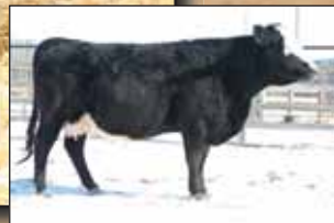
EDN PEAL 56P Dam of Lot 15

Beef up your calves with this powerful long bodied, star faced bull. Very thick butted with a rounder muscle pattern and a little more bone. Again structurally sound, good disposition & testicles. An EPD of +11 for CE and 71.2 for yearling wt. His dam is moderate and thick, good uddered with a blaze face. 68D & 52C cow families.