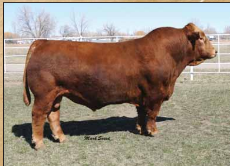
TNT TOP GUN R244 Sire of Lot 43

A very thick, complete made calf. His dam is a straight red, beautiful uddered, Good-A-Nuff daughter that traces back to the 31K cow. The Good-A-Nuff females are some of the best in the breed.