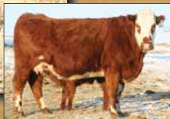
EDN PEACOCK 169P Dam of Lot 13

EDN Sprout 48S had been retained as a backup bull, but has now become an important part of our program, at 5 years old his feet are perfect, his attitude is unbelievable and he is a bull that will easily maintain and even fatten on hay. He is a Grandson of the 29G cow.