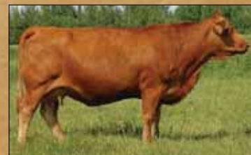
WFL MS Westway 27L Great Grand Dam of Lot 58