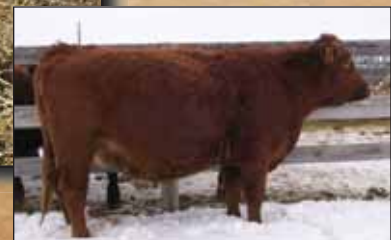
TPP CROCUS MS UNIQUE 13U Dam of Lot 1