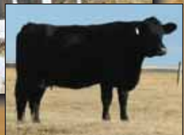
TSZ TOP NOTCH 29P-127T Dam of Lot 34