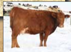
EDN STARGAZER 127S Dam of Lot 22