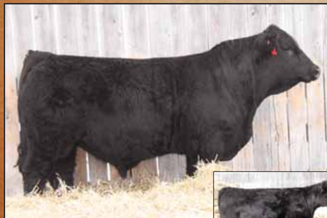
BOUNDARY REBECCA 38W Maternal sister to Lot 67 by Trademark