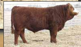
LFE BULLETPROOF 439R Sire of Lot 23