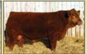
Sire: CMS Sentinel 507C