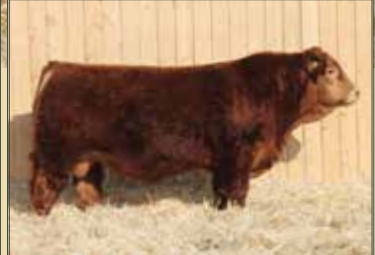
Sire LFE BS Lewis 813Y