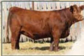
Dam: MRL Miss 6858D