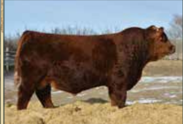
15X son & Sire of Lot 42 & 43: Boundary Esquire 6C

PG1239433 BOUN 118F POLLED JAN. 22, 2018