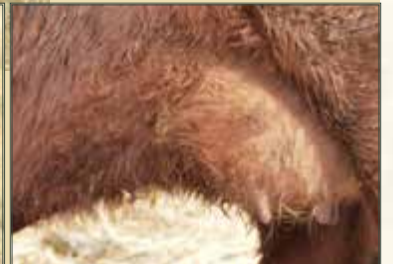
Dam: Boundary Marigold 29W