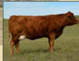
Dam of Lot 37 & Maternal Sister of Lot 36: Boundary Heidi 112C