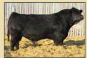
Sire: Tess Black Rampage 71W

BPG1239512 BOUN 133F POLLED JAN. 25, 2018