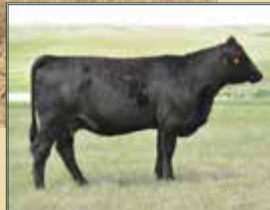
Dam: Boundary Myra 173D

PG1239511 BOUN 128F POLLED JAN. 24, 2018