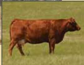
Dam of Lot 36 & Grand dam of Lot 37: Boundary Heidi 58Y