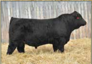
Maternal Brother to Dam: Boundary Discovery 39E