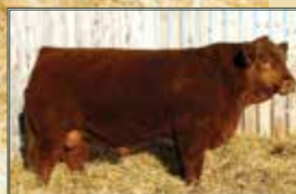
Sire: CMS Sentinel 507C

A big time curve bender here, just a 71 lb birthweight, posted a strong weaning weight and has WW and YW EPDs in the top 15 and 25% respectively. He reminds us a lot of his sire with his wide top, big hip and excellent muscle pattern. He has that same strong presence and look that all the Sentinel sons possess. Expect him to pass on his appealing physical traits and that desirable birth to weaning spread that is hard to come by.