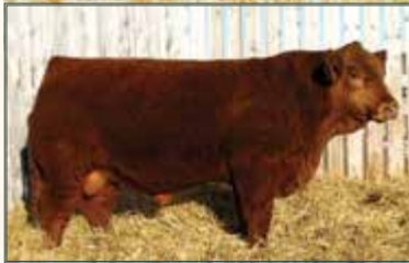
Sire: CMS Sentinel 507C

This bull is impressive from every angle. Full through the flank, deep through the heart and a big hip that carries all the way down. When you get in behind him he has so much width over the top and a ton of awesome hair. His mother comes from one of our very best cow families, back to the 16P female that has had such a strong influence for us. A maternal brother sold in last year's sale selling to S Bar B Farms at Fox Valley. This bull will add muscle shape, hair and improve udders, just like all the cows in this family. Both the bull himself and his genetics say that his progeny will be outstanding.