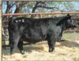
Maternal Sister: X-T Black Mistress 44E

A smaller framed MISSILE calf that would sure thicken up and moderate a herd of cows with excessive frame and not enough body capacity. The MISSILE sire sure worked great on big framed cows. This bull has a real small neat head and a great thick coat of hair – he's ready for the -30 temps. His dam is a typical WALK THE LINE cow; picture perfect udder and so sound in the feet and legs.