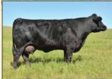
Dam: Boundary Tango 135A