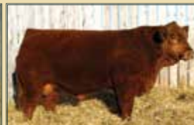
Sire: CMS Sentinel 507C