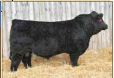
Full Brother: Boundary Cobra 89D

BPG1239408 BOUN 11F POLLED JAN. 02, 2018