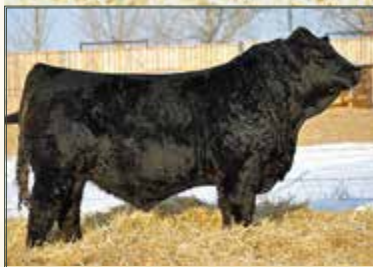
Sire: RF Captain Black 430B