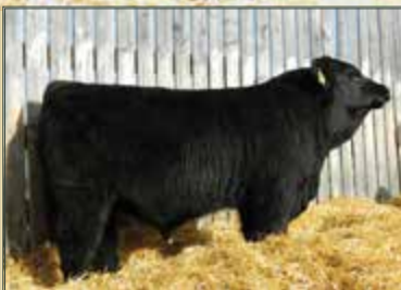
Maternal Brother: TPP Crocus Thor 74D