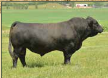
Sire: Double Bar D Motley 412C