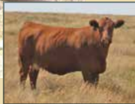
Dam: Twin Brae Bettina 402B