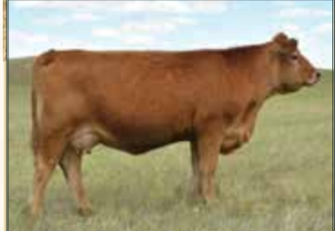
Dam: Boundary Tumbler 107D