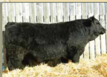
Maternal Brother: TPP Crocus Thor 60E