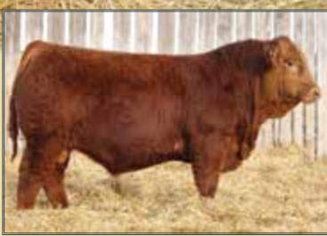
Sire of Lot 31-36: MRL Capone 130B