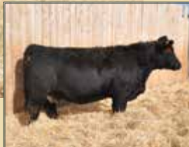
Dam: Boundary Reggie 171Z

BPG1239421 BOUN 85F TWIN POLLED JAN. 17, 2018