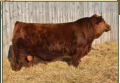
3/4 Brother: Boundary Scarface 154D