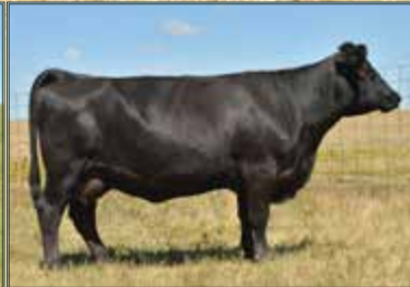
Maternal Sister to 135A: Boundary Tango 28Z