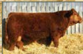
Paternal Brother: TPP Crocus Sentinel 10E