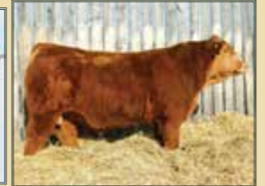
Grandson of 7X: LTS Crocus Force 26C