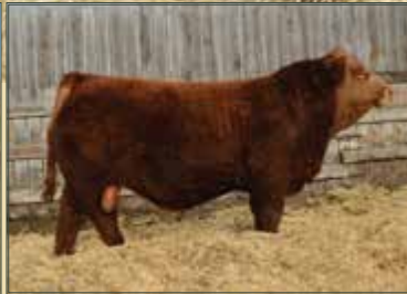
Maternal Brother: Boundary Capone 26D