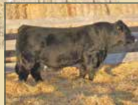
Maternal Brother: X-T Black Diesel 2D