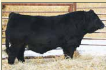
Sire: LFE Commissioner 811Z

This bull has stood out from a very young age. We believe he is unique in his kind, and would be great asset to many programs. He is very smooth through the front third, displays great rib shape, tremendous depth and is so full through the hind quarter. He is as complete as you will find and balanced in every way. Combine this with just a 78 lb birth weight and a tremendous birth to weaning spread; the potential is huge for this herd sire. His young dam is proving her worth in a big way, her first calf is one of our top bred heifers, and she followed that up with this exciting herdsire. He is a unique blend of power and eye appeal that is so rare to find. We are very excited about this bull's future.