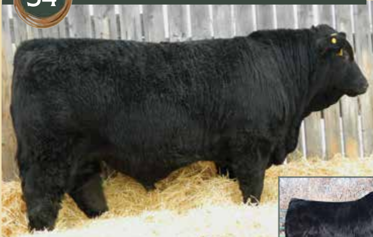
Grandsire: Wheatland High Voltage