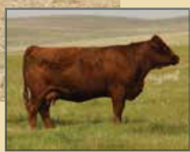
Dam: Boundary Amber 186B