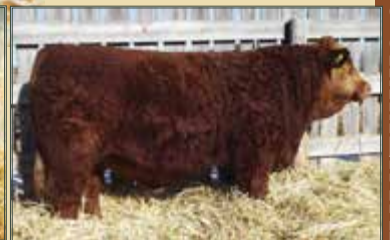
Brother to Dam: TPP Crocus Amarillo 24Y