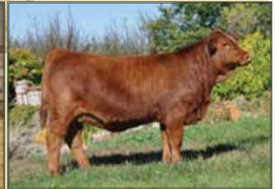
Maternal Sister to Dam: Boundary Sarah 170B