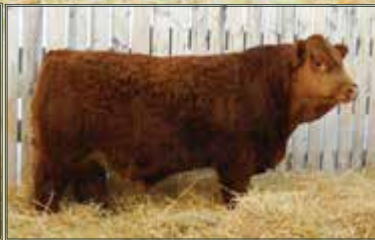
Brother to Dam: TPP Crocus 9A