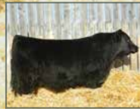
Maternal Brother: TPP Crocus Cobra 57E

A powerfully constructed bull with great length, depth, rib shape and balance. Very sound and free in his movements, standing on a wide, correct base. His dam is a very nice uddered, strong producer that raised one of our top black bulls last year selling to Cypress Colony from Maple Creek. These Commissioner sons are so consistent in their type, added dimension and muscle while still maintaining eye appeal. They are right for the times and what the industry demands. Performance, structure and predictability are a sure thing with these brothers, take advantage! Homozygous Polled Homozygous Black