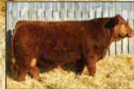
Paternal Brother: TPP Crocus Sentinel 10E

Huge hipped, big middle, soft made and free moving are all words to describe this impressive individual. This is the type we strive to raise, solid made with lots of natural thickness and hair. He will sire those awesome blaze face females that are always in such high demand at every bred heifer sale. His sire Sentinel has really impressed us with his ability to sire both bulls and females with great muscle patterns and eye appeal. Good performance, large testicles and gentle dispositions are some of the traits he will pass on to his calves. We think very highly of this bull, and we think you will see why.