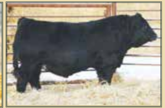
Sire: LFE Commissioner 811Z