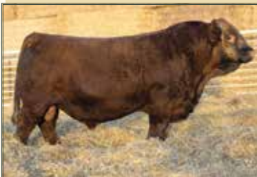
Sire: WFL Westcott 24C

35R RF RAUL DAY RED RESULT 9S TPP CROCUS MISS RED 9T