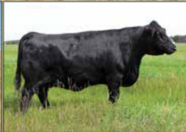
Great Grand dam of Lot 19 and Dam of Lot 21: LFE Ready To Tango 609S