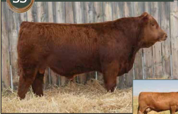
Dam of Lot 33 & Grand dam of Lot 34: Boundary Reggie 8T