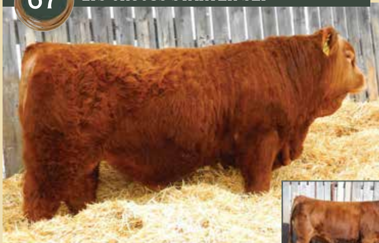
Dam: MRL Miss 6757D