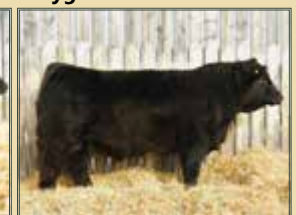
Maternal Brother: LTS Crocus Lotto 4C