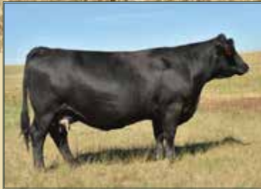
Grand dam: Boundary Sarah 19Y