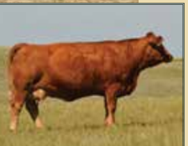
Dam of Lot 38 & Grand dam of Lot 40: Boundary Amber 65Z