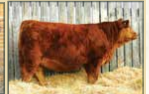
Paternal Sister: LTS Crocus Westlyn 21E