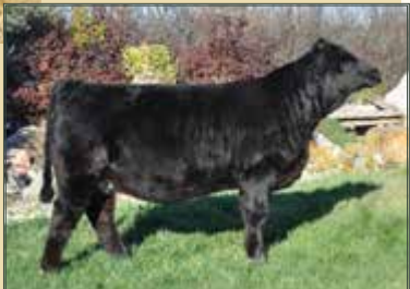
Maternal Sister: Boundary Sarah 7C

BPG1239409 BOUN 15F POLLED JAN. 02, 2018