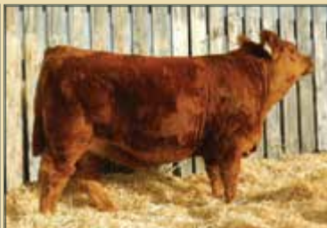
Paternal Sister: TPP Crocus Westlee 26E