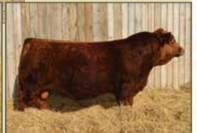
3/4 Brother to Dam: Boundary Astute 4C