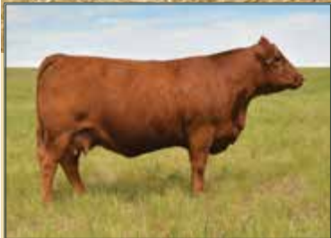
Dam: Boundary Kendra 28C