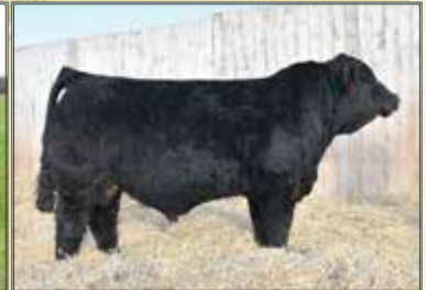
Maternal Brother to Dam: Boundary Sweet Meat 51B