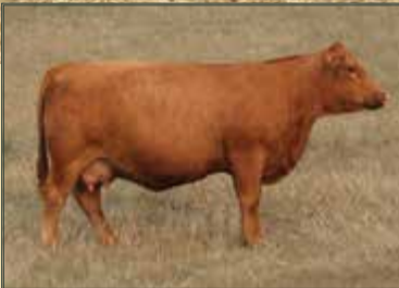
Maternal Grand dam: Springcreek Kendra 71W