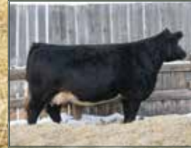
Grand dam: Boundary Storm 11X

Homo Polled Test pending Heterozygous Black