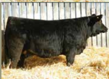
Paternal Sister: LTS Crocus Pandora 15F