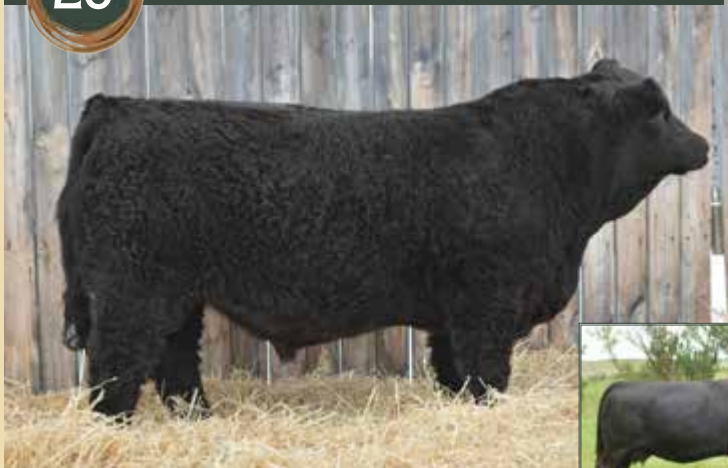
Dam: Boundary Abricot 131Z Maternal Sister to dam of Lot 25