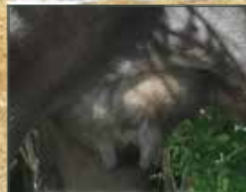
Udder Quality of Dam: Boundary Storm 217D