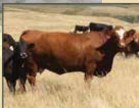
Dam: Oakview Becky 181B