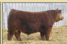
Brother to Dam: KOP 165A