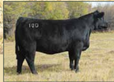
Maternal Sister: X-T Black Debutante 10D

This is a bull that needs to go to a new home where his full potential will be realized. He will make a hell of a herd bull for his new owners. The MISSILE's both males and females are such perfect beef cattle; long, super thick, and extremely deep ribbed. The temperament on the guy is just amazing, he just wants to be everyone's buddy. His dam is a great young cow, perfect feet and udder, and super attractive. She is the dam of the IGNITION bred that we sold to Labatte's at Agribition and went on to produce one of their feature bulls by MISSILE in their 2019 bull sale.