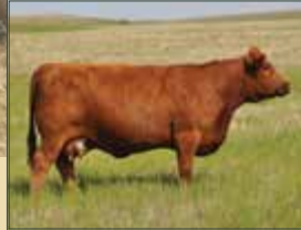
Dam: Boundary Reggie 194B