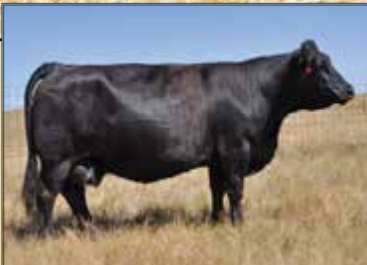
Grand dam: Kimlake Abricot 511R