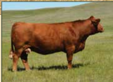
Dam: Boundary Sweet Marie 53C