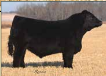
Sire: NCB Cobra 47Y