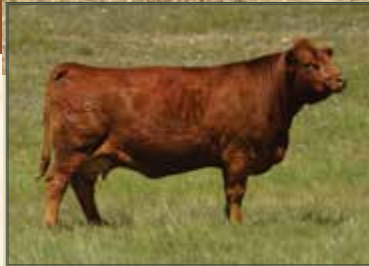
Dam: Boundary Sarah 62A