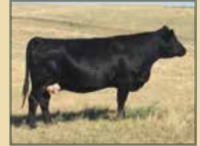
Maternal Sister to Dam: Boundary Storm 42B

BPG1239420 BOUN 81F POLLED JAN. 17, 2018