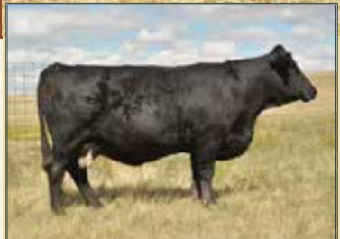
Grand dam: Boundary Sarah 91Y