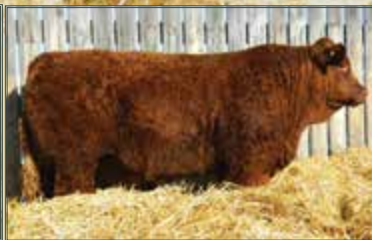
Maternal Brother: TPP Crocus Diablo 37E