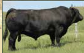
Maternal Grand Sire: MRL Walk The Line