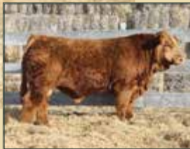
Maternal Brother: X-T Red Distinction 14D