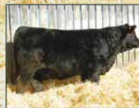
Grand daughter of 135U: LTS Crocus Prism 33F