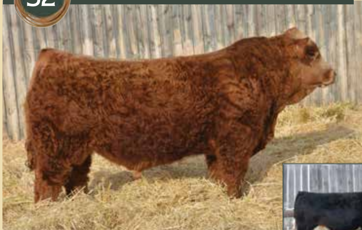
Dam: Boundary Storm 11X