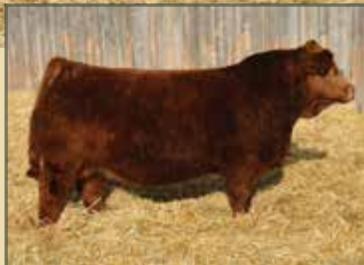
3/4 Brother to Lot 44: Boundary Motley 163E