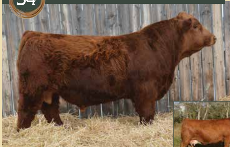
Maternal Sister to Lot 34: Boundary Reggie 156D