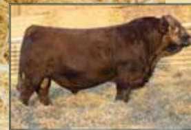
Sire: WFL Westcott 24C