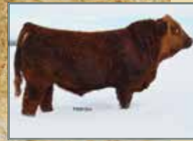
Sire: BLI Red Addiction 224Z