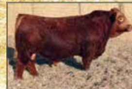
Grandsire: LFE Vegas 3145A