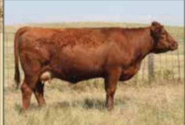
Great Grand dam: Boundary Tumbler 15X