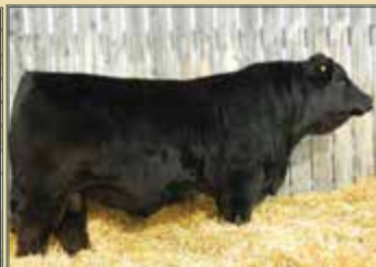
Paternal Brother: LTS Crocus Commiss 40E