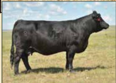
Dam: Boundary Abricot 5B