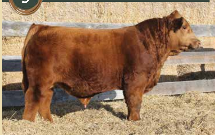
maternal brother to 16F