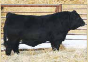
Sire of Lot 20 and 22: LFE Commissioner 811Z