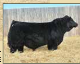
Full Brother to Lot 21: Boundary Riddler 48E

This fellow certainly draws the eye. He is deep bodied, wide hipped, and has lots of hair. We sold 2 flush mate brothers to 41F in last year's sale to Percyview Farms and we have a full sister in the replacement pen that is really special. His dam has many excellent daughters in herd and has produced a Champion and Reserve Champion bull calf at SCPS and the Champion female at Regional fair. 41F is above average for all major traits with EPDs top 25% CE & MCE, 20% BW & WW, 10% YW, 35% MWWT. Homozygous Polled Homozygous Black