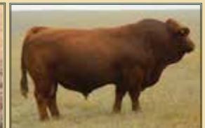
Sire: Crossroad Validate 24D