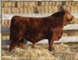
Maternal Brother: X-T Red Crush 5C