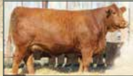
Dam: MRL Miss 6604D