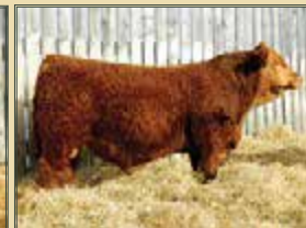
Maternal Brother TPP Crocus 23C