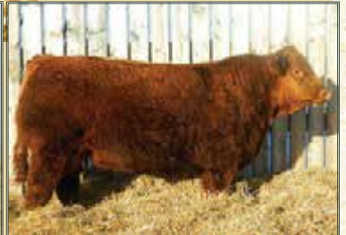
Maternal Brother: TPP Crocus 19B