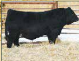
Sire: LFE Commissioner 811Z