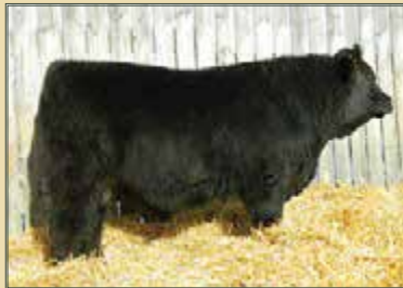
Paternal Brother to 57E