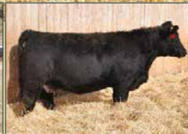
Grand Dam: Boundary Reggie 171Z