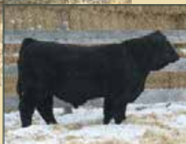
Maternal Brother to 104E

This deep cherry red calf sure turned it on when he was put on feed. His dams first calf was a bull through this sale, her second a 700 lb steer calf and then 104E here today! The WALK THE LINE cows are excellent females all with perfect udders and are very fertile and sound.