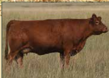
Grand Dam of Lot 58 and Lot 49 Kimlake Tumbler 550R