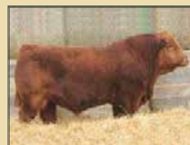
Sire: IPU Red Zone 16A