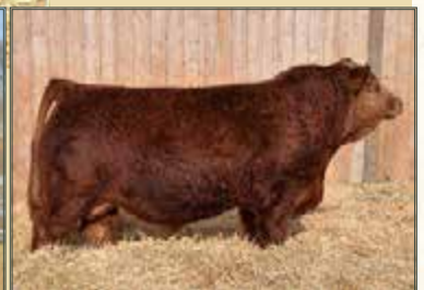
Maternal Brother: Boundary Identity 11A

BPG1200999 BOUN 142E POLLED JAN. 30, 2017