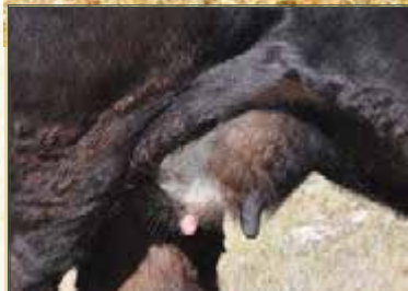
Dams Udder: Boundary BLK Reggie 130C