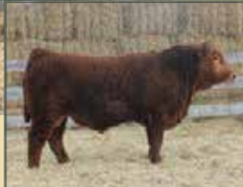
Maternal Brother to 8E

All good herd sires must have a great dam and this guy sure has that. Her first calf went through this sale to Crooked Creek Simmentals; a calving ease HIGH VOLTAGE son they think highly of. Then she had a set of twins and then bred right back with this MISSILE son. This bull is a littler bigger framed with a lot of performance.