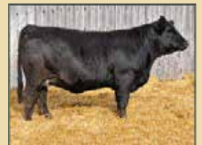
Dam: NUG Ruby 596C

BLACK FORCE is a calving ease Cadillac! With his light birth weight, his pedigree, moderate bone and frame, he is a natural for the heifer pen. There is more to this bull than that, however. His first calf dam, a great young MRL DISCOVERY daughter, was a high seller from Maxwell's at the Camrose Country Classic Sale. This bull is 90 days older than the rest of our bulls but was managed the same, so this really affected his weaning performance. He made up for poor management when he was put on feed. This guy is much more than just a heifer bull! Homozygous Polled Heterozygous Black