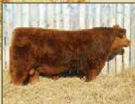
Paternal Brother to 37E TPP Crocus Diablo 17B