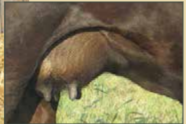
Tango 28Z's udder: 5 years old