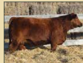
Maternal Sister to 75E