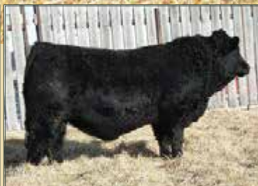
Sire of Lot 49 and Lot 50 Double Bar D Motley 412C