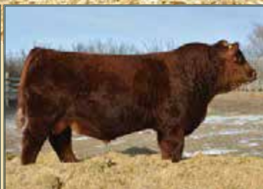
Maternal Brother: Boundary Esquire 6C