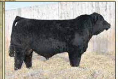
Maternal Brother to Dam: Boundary Sweet Meat 51B

PG1201020 BOUN 204E POLLED FEB. 19, 2017