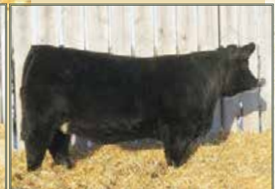
Maternal Sister to 40E