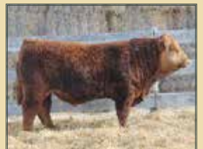
Maternal Brother to 4E

This is real nice moderate boned calf with a big spring of rib and a good thick top. His dam is a real nice sound young cow whose first calf also went through this sale. We all know what the RED MOUNTAIN cows produce like so we are sure that a MISSLE x MOUNTAIN cross will produce excellent females. Homozygous Polled