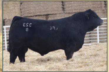
Sire: LFE The Riddler 323B