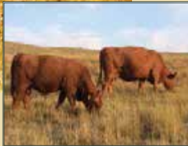
Dam: LTS Crocus Ms Iron 19Z with Sentinel 24E