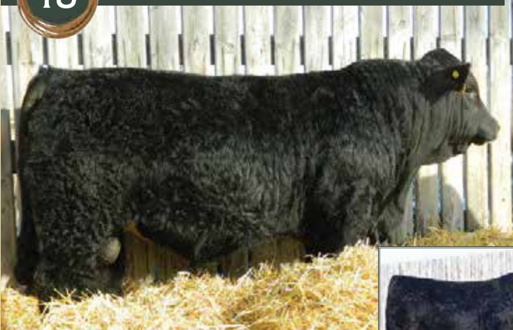
Sire: Springcreek Lotto 52Y