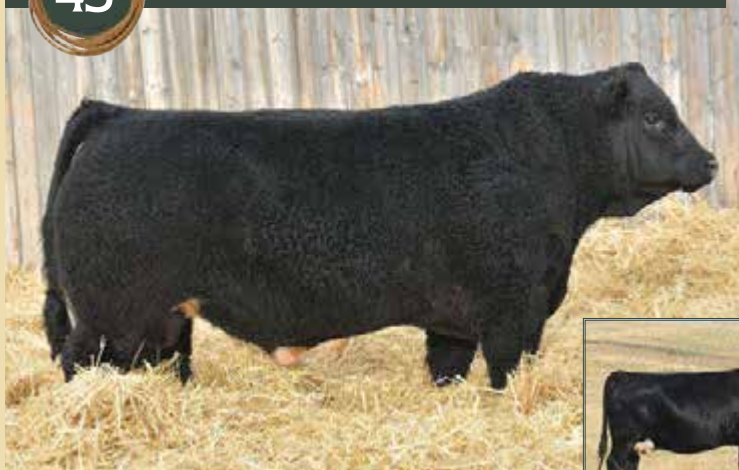
Dam of 29E and Maternal Sister to Lot 42: Boundary Storm 42B