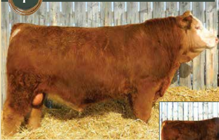
Maternal Brother to 9E LTS Crocus 26B