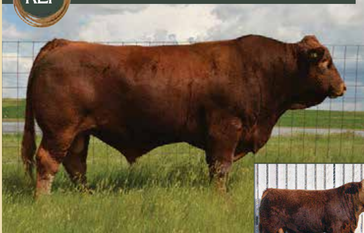
Full Brother: IPU 68M Horizon 309Z