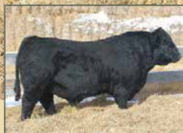
Sire: MRL Missile 138C

ROCKET MAN was pictured mid December just before being displayed at the Medicine Hat Pen Show. His dam is a big bodied, solid red OH KAY cow who raised us an excellent BEEF KING replacement female on her first effort. She is a perfect footed, perfect uddered young cow that you would just love if you saw her. 14E has been a standout since he was a young calf in a strong group of MISSILE calves that are all good. We had over 80 MISSILE calves born in 2017 and there was not one who was not an improvement on what their dams had done in the past. All our MISSILE calves are so consistent and similar in type, you can just pick them out of a group as they are so distinctive. MISSILE calves very well with most calves in the 80 - 90 lbs. range. We only had one calf at a 100 lbs. out of a big high birth weight cow. Purebred breeders take a good look a these top end MISSILE calves, they will move your program along in the right direction.