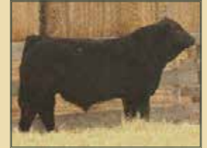
Maternal Brother to 89E

This is a real nice moderate framed bull with just the right amount of bone. He really has that herd bull look at a young age. The dam is a cow we have always liked for her natural thickness and productivity. The HEAVYWEIGHT cows have all been a great sire group and always raise a good calf no matter how they are bred. Expect this bull to sire an excellent group of daughters. Homozygous Polled Heterozygous Black