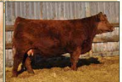
Great Grand Dam: Boundary Reggie 2X

BPG1200994 BOUN 101E POLLED JAN. 21, 2017