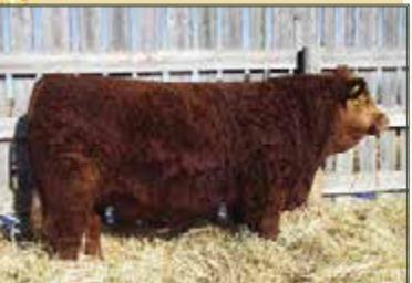
Dam: TPP Crocus Ms Label 3U