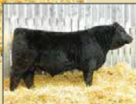
Full Brother TPP Crocus Thor 72D