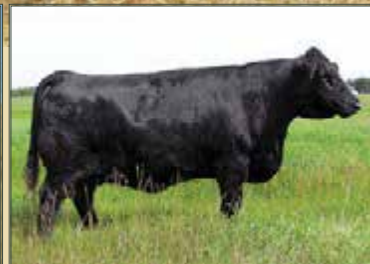
Great Grand Dam: LFE Ready To Tango 609S