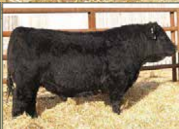
Sire: MRL Discovery 21A