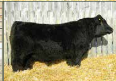
Maternal Brother to 40E