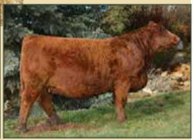
Maternal Sister: Boundary Reggie 86C