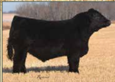
Sire: NCB Cobra 47Y