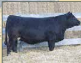
Maternal Sister to 117E