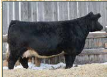
Dam: Boundary Storm 11X Grand Dam of Lot 43