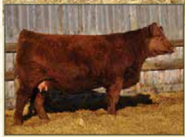
Dam: Boundary Reggie 2X