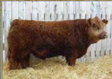
Maternal Brother: TPP Crocus 17A