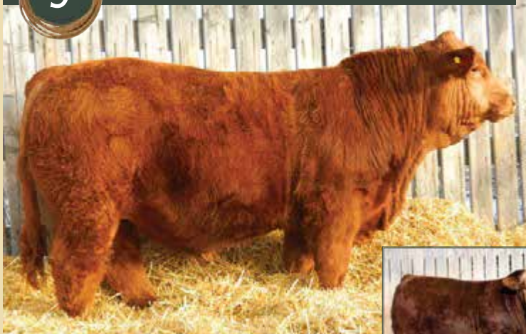
Sire: IPU Red Deputy 25C