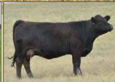
Maternal Sister: Boundary Tango 136C