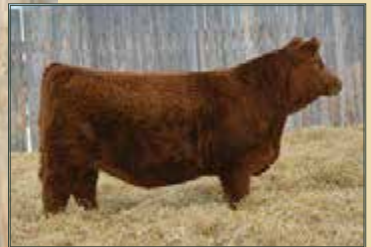
Maternal Sister: Boundary Tango 90E