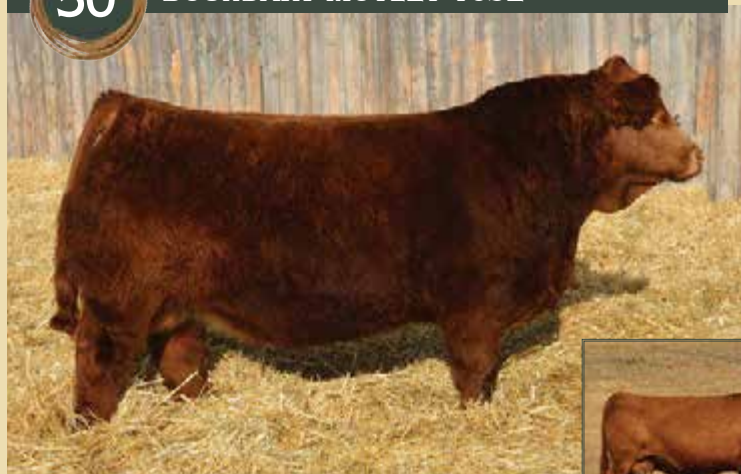
Dam: Boundary Sweet Marie 62Y