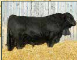
Sire: MRL Thor 207B