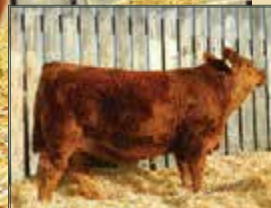
Paternal Sister TPP Crocus Westlee 26E

A big time herd bull prospect that we are proud to offer. Deep sided, long bodied and loose made, standing on big correct feet. He demonstrates explosive rib shape and width over the top. We along with many breeders have been very impressed with these Westcott calves; they have created quite the buzz in the last few months. This bull's dam is a model female with a picture perfect udder and has been an excellent producer in her career. This is a bull that ties it all together, both in genetics and phenotype. He has tremendous potential and will have a big impact in the future.