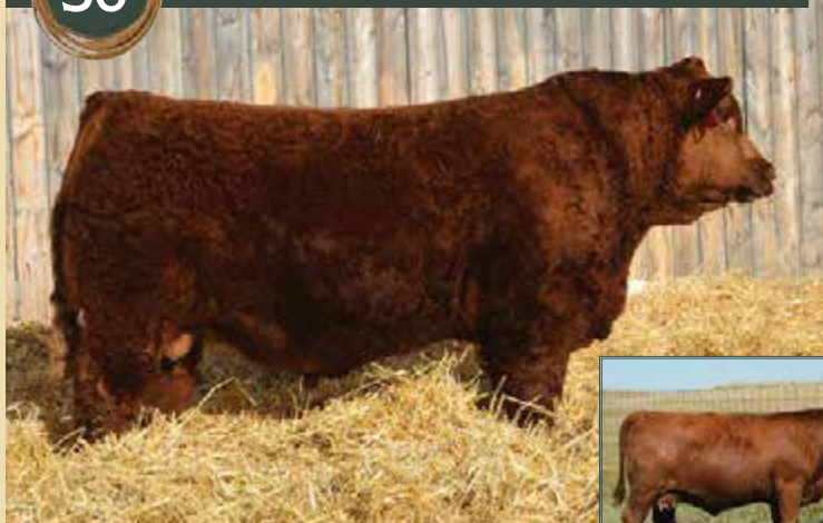
Dam: Boundary Reggie 114B