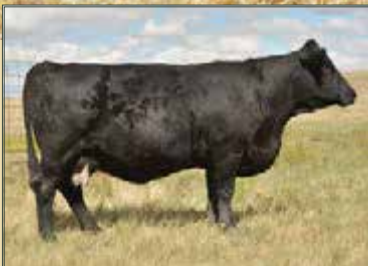
Dam: Boundary Sarah 91Y Grand Dam of Lot 37

A smooth, balanced, powerful Discovery son with big testicals. We have a couple Discovery daughters in production now that we have been impressed with. His dam is a tank with tons of milk. She has two daughters in production, a powerful Full Throttle and an Odin with a son in the sale Lot 37. 91Y's granddaughter was Champion Heifer Calf at Ranchmens Pen Show in Swift Current and Junior Champion at Expo boeuf. 39E has EPDs in the top 30% BW, 3% MCE, 15% STAY. His phenotype is very similar to that of his sire as a yearling. Discovery 39E will not be hard to find sale day. Homozygous Polled Homozygous Black