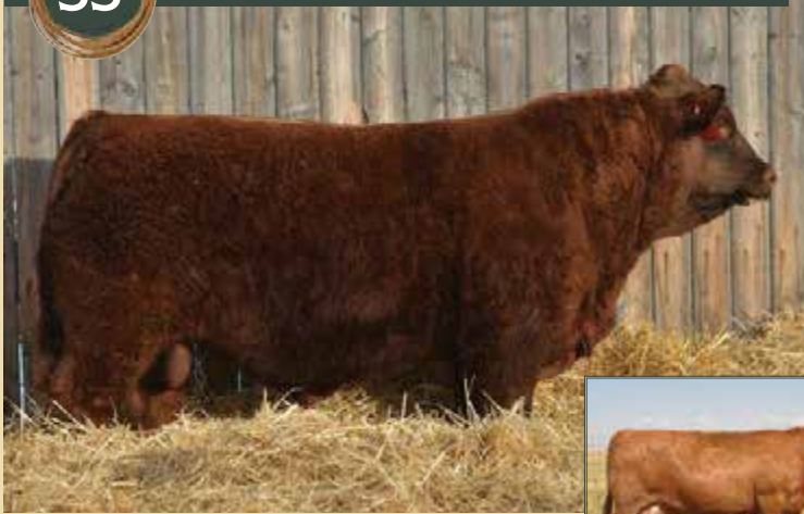
Great Grand Dam: Boundary Reggie 8T