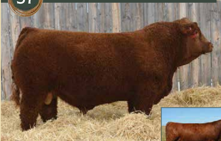
Dam: Boundary Nikki 180B