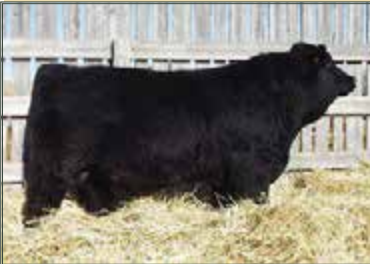
Maternal Brother to 33E

3D BLK FULL THROTTLE 483X WHEATLAND BULL 680S S: LFE COMMISSIONER 811Z CROSSROAD RAMONA 375R LFE BS LASS 189X LFE THE DARK NIGHT 350U MARK'S MS SHOLOGAN 51R TNT DYNAMITE BLACK L137 TH BLACK EDITION 8R BBN MS BLACK LADY 28H D: TPP CROCUS MS EDITION 24W SPRING VALLEY D880 MISS PARKHILL 12K DONERRY 8D