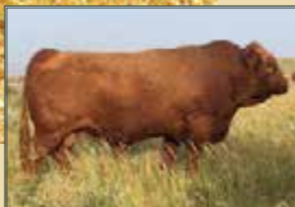
Sire: WFL Thor 22B

He is soggy, soft sided, with loads of hair and just an 82 lbs. birth weight. With his explosive rib shape combined with tremendous eye appeal, you wouldn't guess he is just a March born bull. His dam is a perfect uddered Amarillo daughter who did a great job here. The Amarillo daughters are very broody, angular females that are becoming some of our strongest young cows. This is a bull that will put a lot of muscle shape and style into his calves, have a look here.