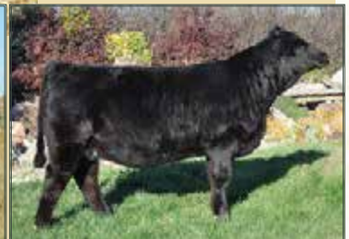
Granddaughter of Sarah 91Y: Boundary Sarah 7C

BPG1200982 BOUN 39E POLLED JAN. 12, 2017