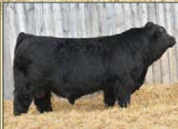
Maternal Brother: Boundary Full Throttle 80D