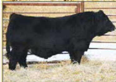
Sire: LFE Commissioner 811Z