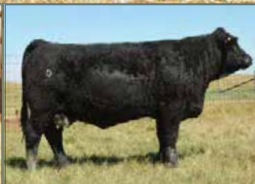
Maternal Sister: Boundary Sarah 48B