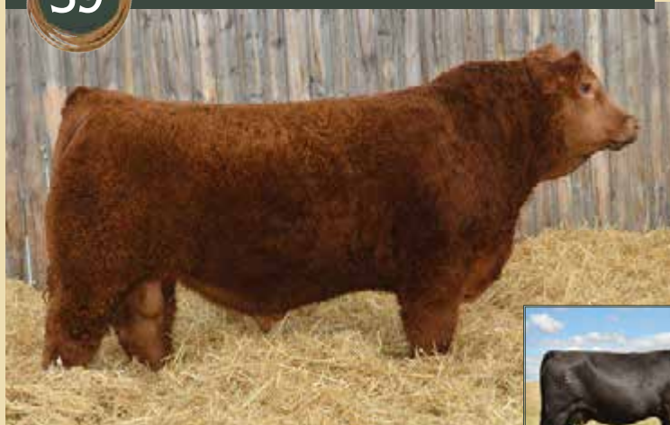
Dam: Boundary Tumbler 158A Maternal Sister to Lot 58

LFE BS LEWIS 322U LFE KJLI DREAMLADY 79W HART RED CHIEF J242 KAPPES JADE J144 RC STINGER 072K TNT MISS HONEY L9 LFE RED INSPRIATION 834L MS WESTERN TUMBLER 12J