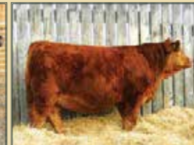
Paternal Sister TPP Crocus 21E