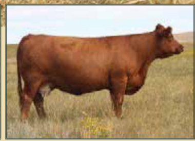
Maternal Grand Dam: Virginia Ms Poll Reggie