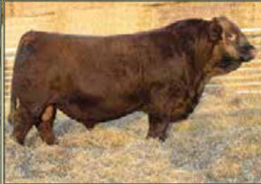
Sire: WFL Westcott 24C