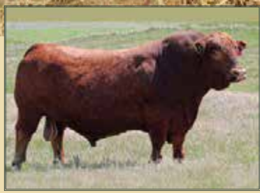
Sire: Come As U R Red Rocket