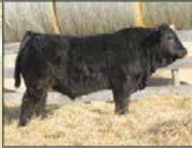
Maternal Brother to 130E