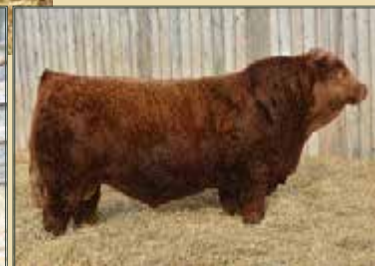
Maternal Brother: Boundary Red Enticer 82C