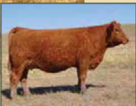
Dam: Boundary Red Tango 151C

PG1200995 BOUN 110E POLLED JAN. 23, 2017