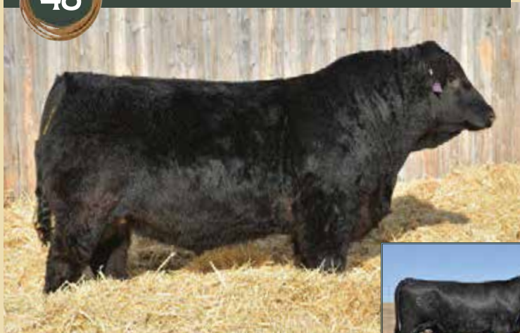
Dam: Boundary Candy 100X