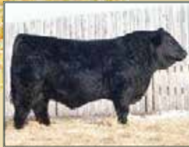
Sire: Springcreek Lotto 52Y