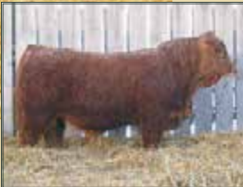
Maternal Brother to 28E