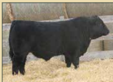
Maternal Brother to 112E

COME AS U R RED ROCKET S: MRL MISSILE 138C MRL MISS 2423Z MRL 130Y MISS XCITING 14X LFE BUNDI 300X MRL MISS 493U MRL BLACK BEAR 79S IPU MS BEEF 98P D: X-T BLACK LINER 104Z X-T MISS BODYBUILDER 122N X-T MISS DASH 89K LCHMN BODYBUILDER 7303F