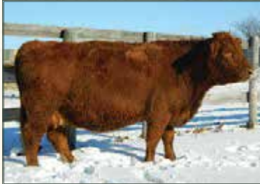
Dam: TPP Crocus Red Tiara 18T