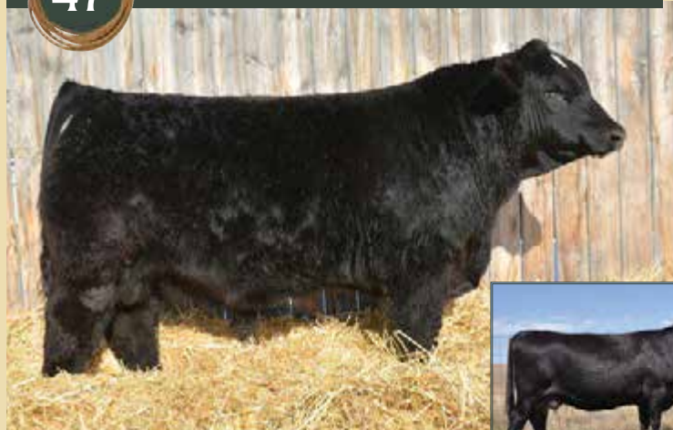
Dam of Lot 47 and Grand Dam of Lot 48: Boundary Silky 333U