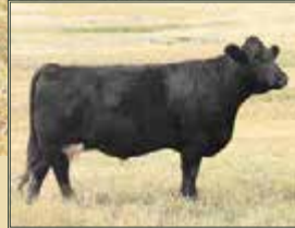
Maternal Grand Dam: Miss Tee 41R

Here is the ranch pet, affectionately called "licks" by our girls. A good balanced bull, with a strong top line, and nice front end. His dam is a moderate framed cow and his grandam is the foundation of our Marigold cow family. EPDs in the top 10% CE, 25% BW, so he should provide some calving ease and add docility to his calf crop.