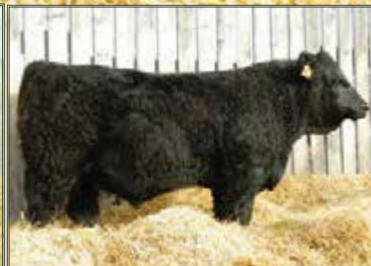
Maternal Brother to 40E