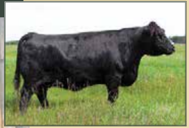
Dam: LFE Ready To Tango 609S