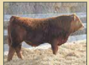
Maternal Brother to 55E

This is a calf we really like. He is very attractive from a side profile with a nice head and smooth shoulder. Talk about capacity – look at the guts on this guy! As we are writing these footnotes, these bulls are only 9 months old but already 55E has a big set of testicles. His SHEAR FORCE dam is a good one! She has had 3 RED ZONE calves in a row; the first is a top end replacement “C” female, and the last two bulls through this sale. Look at all the performance in this calf yet he is moderate boned and frame with only an 87 lbs. birth weight. We think this guy has it all. Homozygous Polled