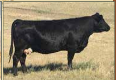
Maternal Sister: Boundary Storm 42B

BPG1200977 BOUN 16E POLLED JAN. 08, 2017