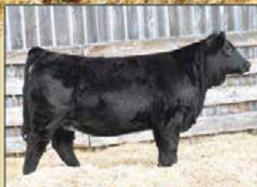
Grand Daughter of 834U: Boundary Tumbler 21C