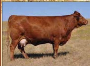
Dam: Kimlake Tumbler 834U