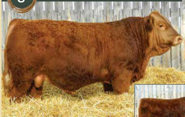
Paternal Brother to 19E TPP Crocus 17B