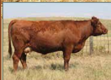
Dam: Boundary Tumbler 15X Grand Dam of Lot 52