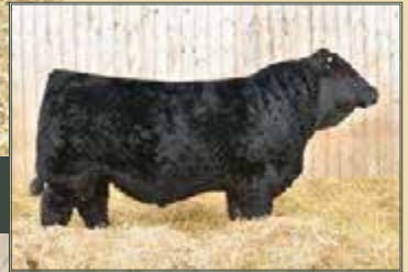
Maternal Brother: Boundary Hot Topic