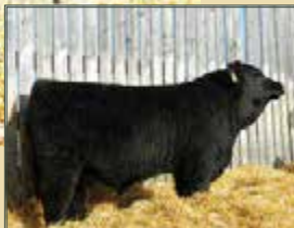
Paternal Brother TPP Crocus 74D