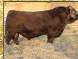
Sire: WFL Westcott 24C

Here is a red blaze face bull that ranks very high. Super stout made with loads of barrel and added rib shape. Westcott has created a ton of excitement with his first calf crop, and it is easy to see why when you analyze these sons. They are structurally sound, free moving and eye catching. He has already become a breed changer and these sons will carry this progress forward. They really are the real deal and will do a ton of good for those adding the genetics to their program. Opportunity awaits!