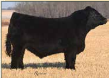
Sire: NCB Cobra 47Y