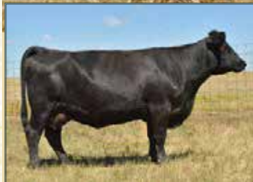
Dam: Boundary Tango 28Z