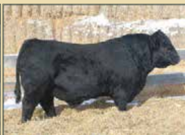
Sire: MRL Missile 138C