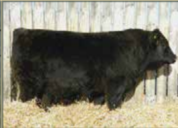
Maternal Brother to 33E