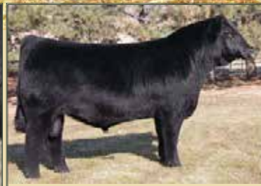
Sire: SS/PRS High Voltage 244X