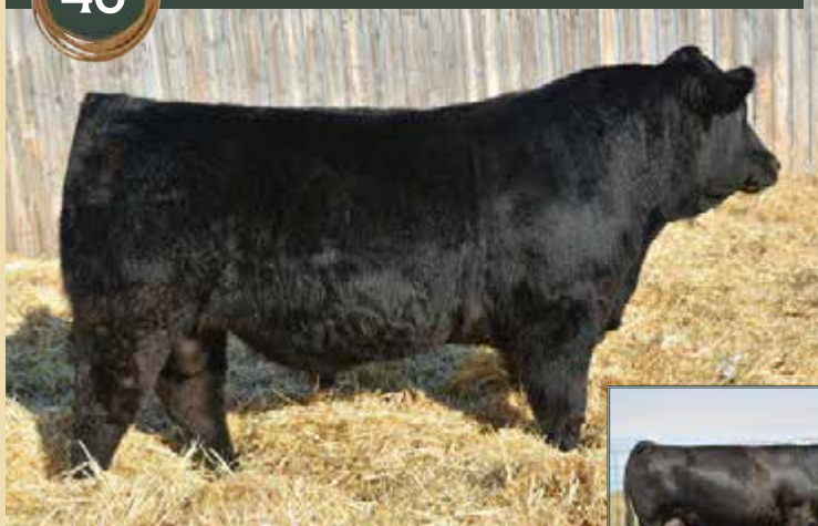
Dam: Springcreek Linnie 23R