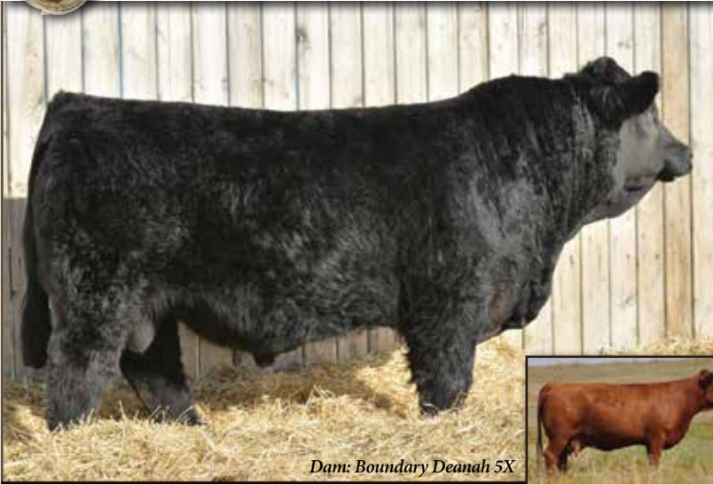
Dam: Boundary Deanah 5X