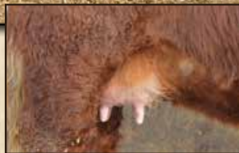
Dam's Full Sister's Udder: Boundary Abricot 164A