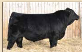
3/4 Sibling to Dam: Boundary Stubby 29B