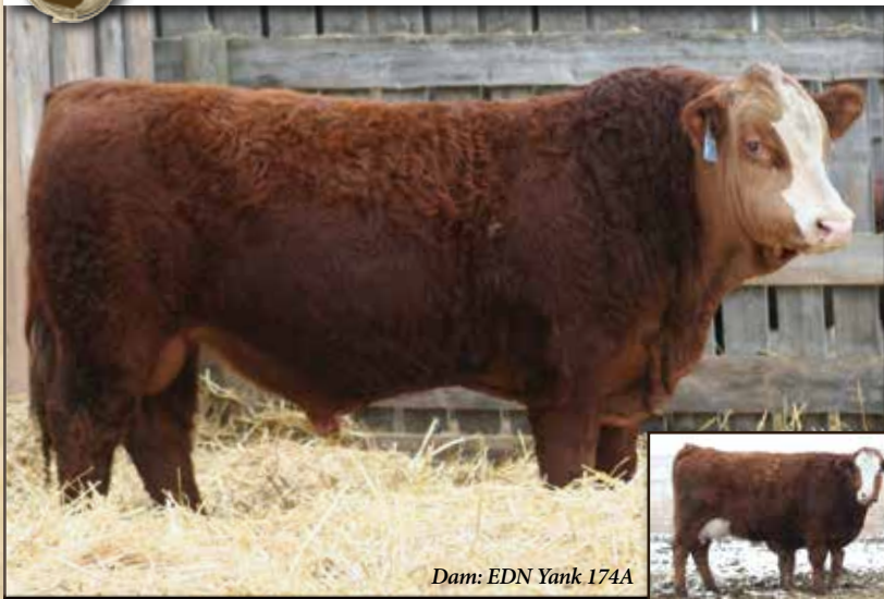
Dam: EDN Yank 174A

S: WS BEEF MAKER R13 DCR MS RIBEYE N72 D: EDN YANK 174A EDN SUNNY 155S NICHOLS BLK DESTINY G151 C&D TRACY R PLUS RED RIBEYE 1134L DCR MISS ZINGER KOP TOUCHDOWNSON 32U WINDMILL MS REDHOT 183S EDN RED NAVAHO 57N EDN KAMI 114K