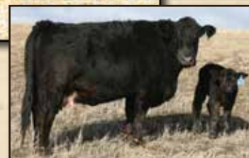
Dam: EDN Valentina 98U

CNS DREAM ON L186 SVF SHEZA BEAUTY L901 WLE BS BENCHMARK TRIPLE C BURN IT UP N34L EDN PUNCH 75P EDN NECTAR 132N IPU BLACK GARRISON 200K EDN MIMI 10M