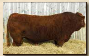
Sire: KWA Amarillo 130Z

SHS ENTICER P1B S: KWA AMARILLO 130Z TLSR SASHA KS BRAVADO P68 D: TPP CROCUS MS BRAVADO 6X TPP CROCUS MS GAIL 28U