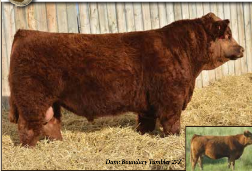
Dam: Boundary Tumbler 27Z