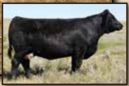
Maternal Sister: Boundary Silky Sarah 6U