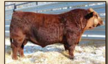
Sire: KWA FLYF Red Mountain 16Z

IPU RED WESTERN 49X S: KWA FLYF RED MOUNTAIN 16Z KWA MS ROCK 14X HWY 5 TONY 80W D: EDN TONY 266A MJ BLACK CHARM 73P