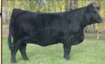
Full Sister: Sunny Valley Lexus 2B

WS BEEF MAKER R13 IPU 52N POCAHONTAS 215U KWA RED ROCK 5T KWA MS BARON 9U TWIN CHIEF MIDAS 248M CONRAY ARLA 152K KAPPES ROCK SOLID H32 IPU MS BLACK JANA 113L