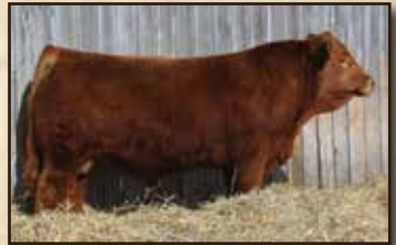
Maternal Brother: Boundary Bravado 14X