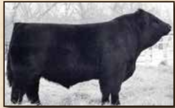
Sire: Wheatland Terminator 202Z