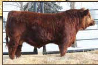
Sire: KWA FLYF Red Mountain 16Z

WS BEEF MAKER R13 IPU 52N POCAHONTAS 215U KWA RED ROCK 5T KWA MS BARON 9U TWIN CHIEF MIDAS 248M CONRAY ARLA 152K KAPPES ROCK SOLID H32 IPU MS BLACK JANA 113L