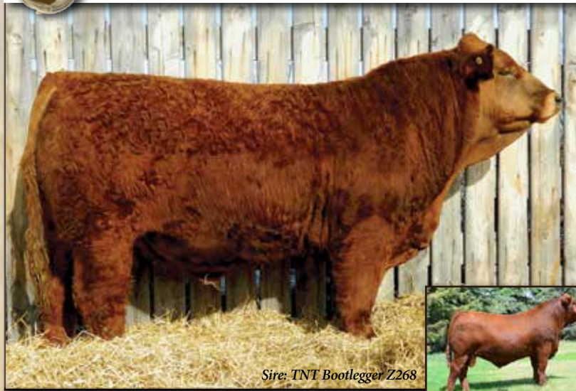
Sire: TNT Bootlegger Z268