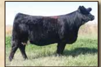
Full Sister to Dam: Sunny Valley Jenna 88U