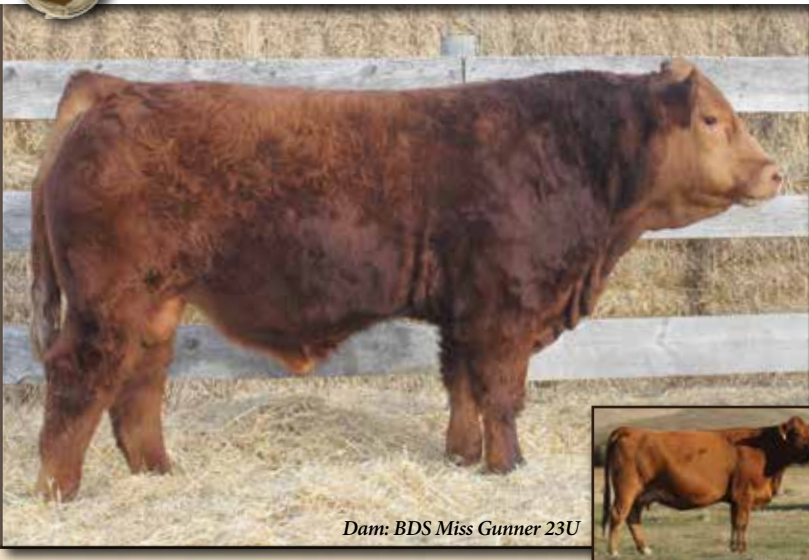
Dam: BDS Miss Gunner 23U

ERIXON GAME FACE 59Y KOP CROSBY 137W S: DCR MR GAME WINNER A147 ERIXON LADY 95U DCR MS C PLUS X331 DCR MR CHOICE PLUS R165 DCR MS BLACK POWER R154 RC STINGER 072K D: BDS MISS GUNNER 23U TNT MISS HONEY L9 PERKS TYRA 66P LCHMN REDEYED JACK 7006D ROLLING JN MAE 66M