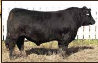
Maternal GrSire: TNT Power Surge

NICHOLS BLK DESTINY D12 TE ERICA E207 B BOZ REDCOAT WBR MISS JUNIOR 2Z TNT GUNNER N208 GSR MS JOKER 113L PVF-BF BF26 BLACK JOKER ULTRA MS PLUS LADY 200M