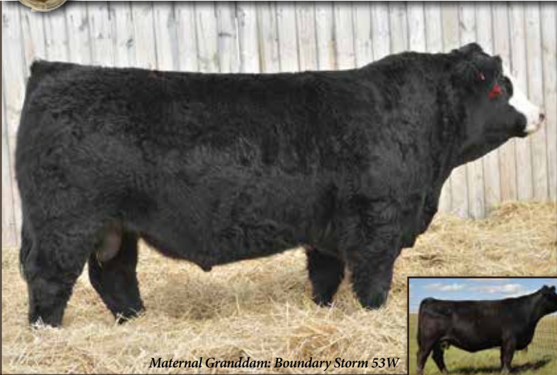
Maternal Granddam: Boundary Storm 53W