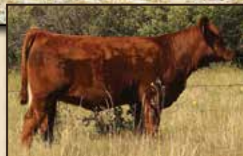
Maternal Sister: LW 1A