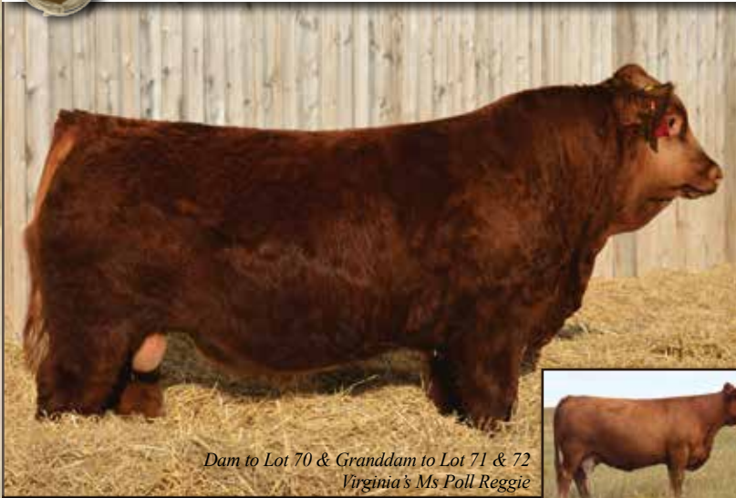
Dam to Lot 70 & Granddam to Lot 71 & 72 Virginia's Ms Poll Reggie