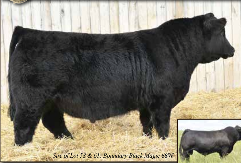
Sire of Lot 58 & 61: Boundary Black Magic 68W

BPRS1139605 BOUN 249C POLLED 19 Mar 2015