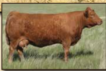
Maternal Sister to Dam: Boundary Renata 3T