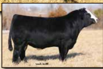
Sire of Lots 54 & 55: FBF1 Combustible