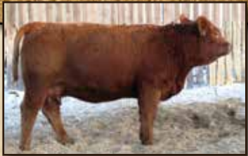
Dam: Kimlake Marie 840U