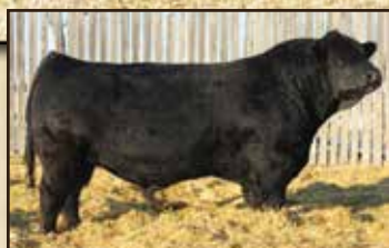
Sire of Lots 56 & 57: TESS Black Rampage 71W