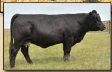
Dam: Boundary Renata 44Z