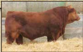
Sire: IPU Red Zone 16A