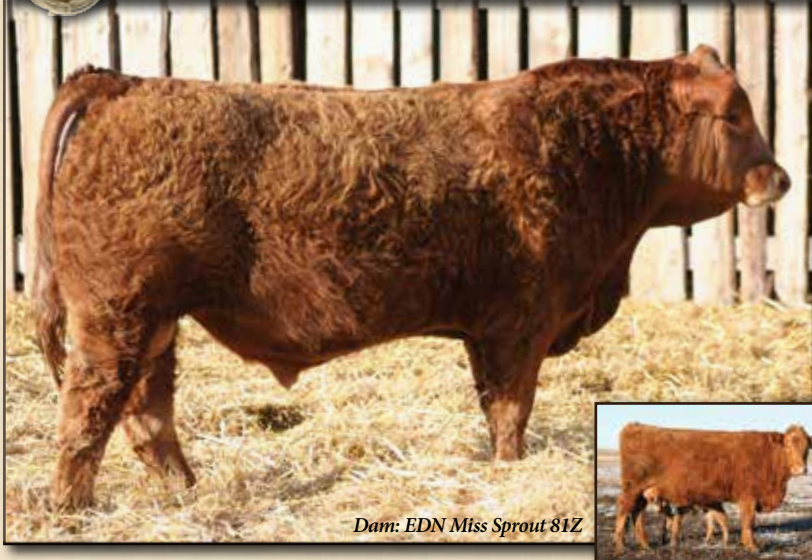
Dam: EDN Miss Sprout 81Z

S: DCR MR MOON SHINE X102 TNT BOOTLEGGER Z268 TNT MISS W70 D: EDN MISS SPROUT 81Z EDN PEACOCK 169P R PLUS 7077T DCR MS SHEARCROCK U302 TNT GUNNER N208 TNT MISS S47 BBS RED CANADIAN L24 EDN MAY 55M EDN JUPITER 75J EDN MISS 68D