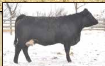
Maternal Granddam: Kimlake Sarah 633S