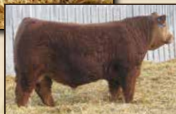
Paternal Brother: KOP 165A

TNT GUNNER N208 GSR MS JOKER 113L NLC GOOD A NUFF 33G MRL MISS 770R WHEATLAND RED TEDDY 457P ACS MS BLACKCAT 30M BRANDED BEEF LCC L397L LAKEVIEW MS MAIN 26K