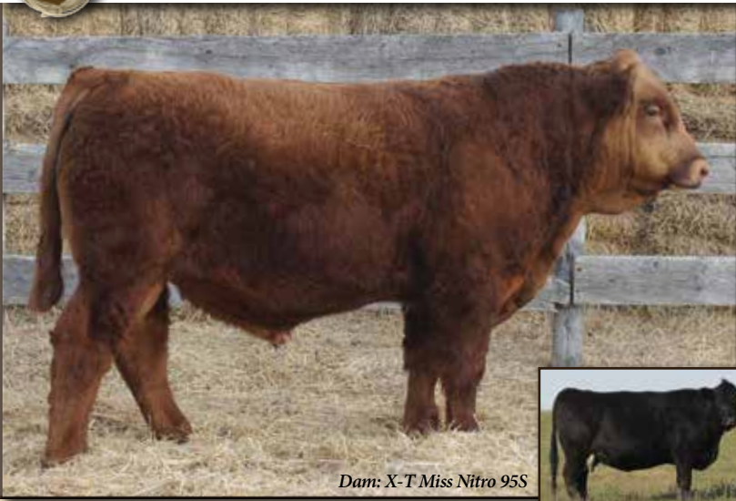
Dam: X-T Miss Nitro 95S

WHEATLAND PREDATOR 922W WHEATLAND BULL 680S S: MRL TRACKER 17Z WHEATLAND LADY 752 T TSN MS EDITION 55W TH BLACK EDITION 8R MRL MISS 899S RW BOMBER 8H D: X-T MISS NITRO 95S OPPS WIS GM2 X-T MISS OVERLOAD 61L WLE OVERLOAD X-T MISS MATERNAL 67J