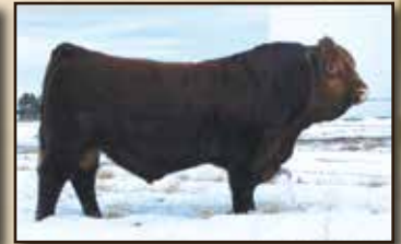
Maternal Grand Sire: Twin-Chief Turbo 41T