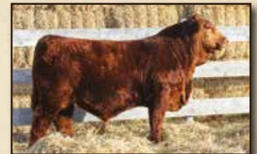
LW 5C at 8 months of age