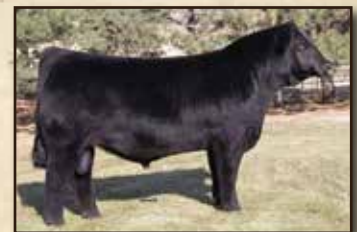
Sire: SS/PRS High Voltage 244X

Here is a super candidate for a calving ease bull for your heifers. Sired by the easy calving High Voltage and with only a 75lb birth weight himself, we would say he is a sure thing. This big, attractive, dark red calf is out of a super, young Neil Carson cow that did a great job on her first calf. MEGA WATT has lots of performance and great carcass EPD's. He's in the top 10% of the breed for Rib Eye Area and in the top 4% for marbling.