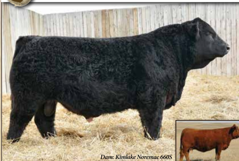
Dam: Kimlake Noremac 660S