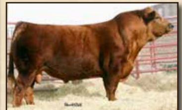
Maternal Grand Sire: THSF Freedom 300N

DCR MR MOON SHINE X102 S: TNT BOOTLEGGER Z268 TNT MISS W70 THSF FREEDOM 300N D: TPP CROCUS MS FREEDOM 17X SLS KENDRA 1K