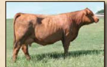
Paternal Granddam: TLSR Sasha