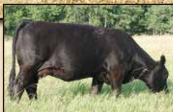
Maternal Sister: Springcreek Sky 50T