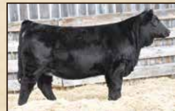
Dam: Kimlake Tumbler 834U