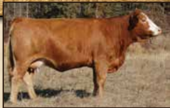
Granddam: Kimlake Marie 342N