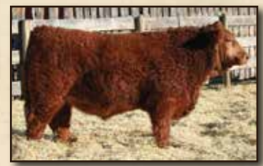
Maternal GrSire: WFL 48Y

HOOKS SHEAR FORCE 38K S: MRL RED FORCE 12U MRL MISS 824S WFL MISSION 48Y D: LTS CROCUS MS MISSION 62A D BAR C GLORY 7X