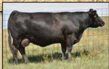
Dam: Springcreek Linne 23R