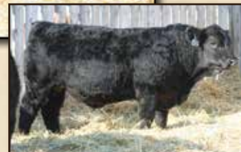
Maternal Brother: EDN 32B

NICHOLS BLK DESTINY G151 ELLINGSON MS PSTOCK K58 GLS MOJO M38 GFI DARLA M410 IPU BLACK GARRISON 200K EDN SWEET PEA 7S EDN VAULT 112U EDN KARISSA 80K