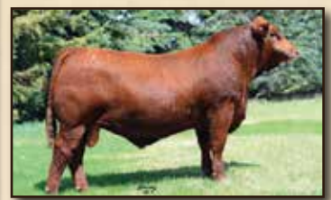
Sire: TNT Bootlegger Z268