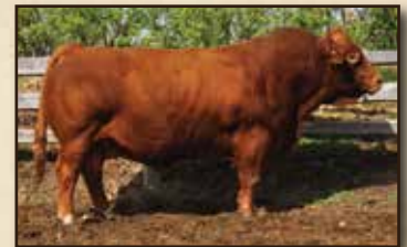
Maternal Brother to Dam: Boundary 2Tempting