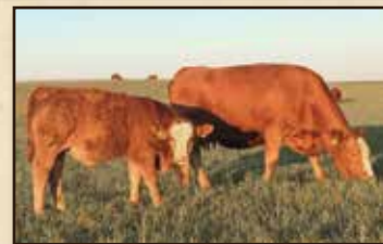
LTS 6C with Dam at 4 months