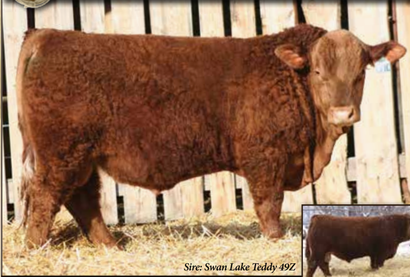
Sire: Swan Lake Teddy 49Z