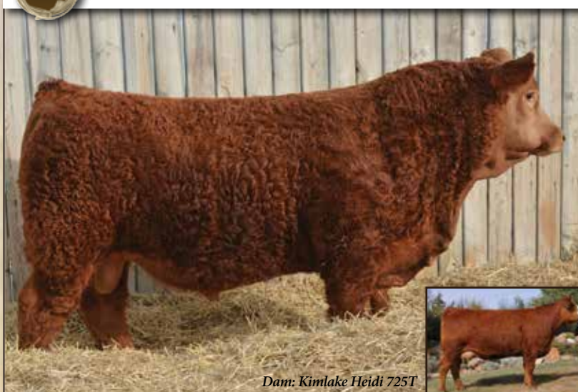
Dam: Kimlake Heidi 725T