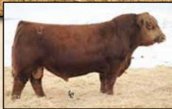
Sire: CDI Authority 77X