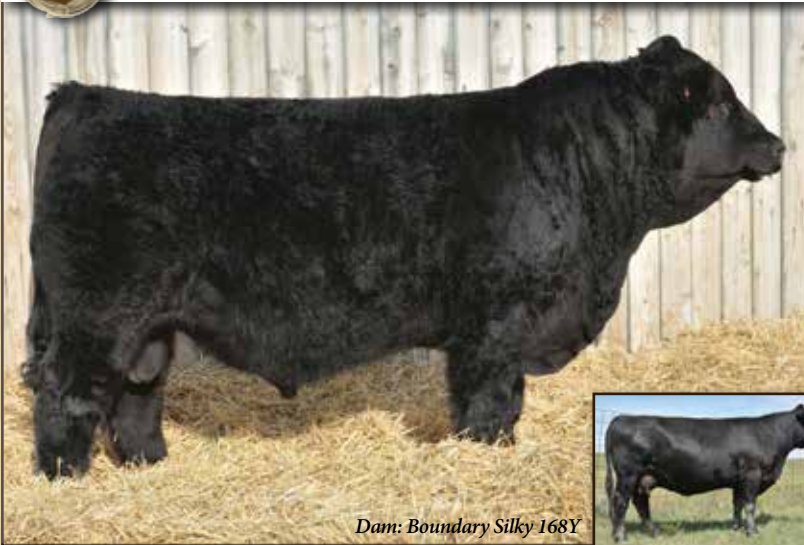
Dam: Boundary Silky 168Y