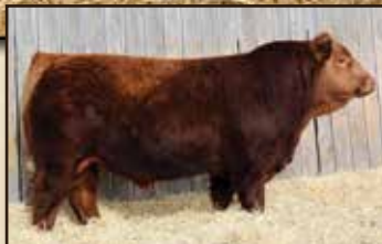
Maternal Brother to Dam: Boundary Crocket 59Y