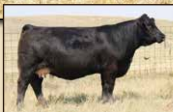
Maternal Sister to Dam: Boundary Sarah 110W