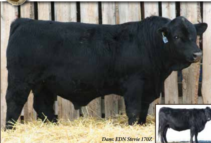
Dam: EDN Stevie 170Z

S: SPRINGCREEK BLK TANK 113T HWY 5 TONY 80W SUNNY VALLEY PAMELA 39P D: KWA RED STEVE 100U EDN STEVIE 170Z EDN PORTIA 126P SPRINGCREEK TANK 63P SPRINGCREEK PHALTLISS 74N HOOK'S RED QUORUM 55H SUNNY VALLEY LAURA 20L LBR CROCKET R81 KWA LADY RED N GOLD 103M EDN MORTON 48M EDN JEZEBEL 10J