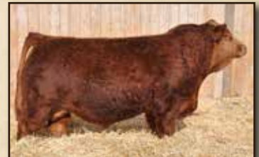
Maternal Brother: Boundary Identity 11A