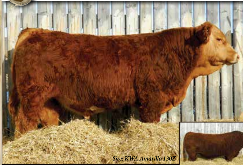
Sire: KWA Amarillo 130Z