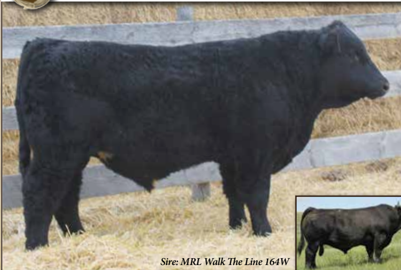
Sire: MRL Walk The Line 164W

MRL BLACK BEAR 79S S: MRL WALK THE LINE 164W IPU MS BEEF 98P IPU BLACK HEAVYWEIGHT 64S D: X-T BLACK HEROINE 197U X-T MISS MAGNUM 212R WHEATLAND BULL 131L MRL MISS 302M TNT MR BEEF 414K LBR D-436 BF L113 HERO PSR MISS PELTON M213 GFI MAGNUM K52 X-T MISS MATERNAL 65J