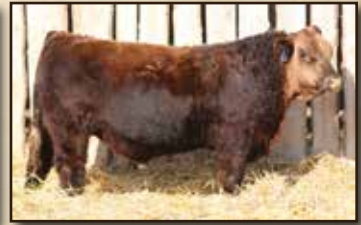
Maternal Brother: EDN 57A