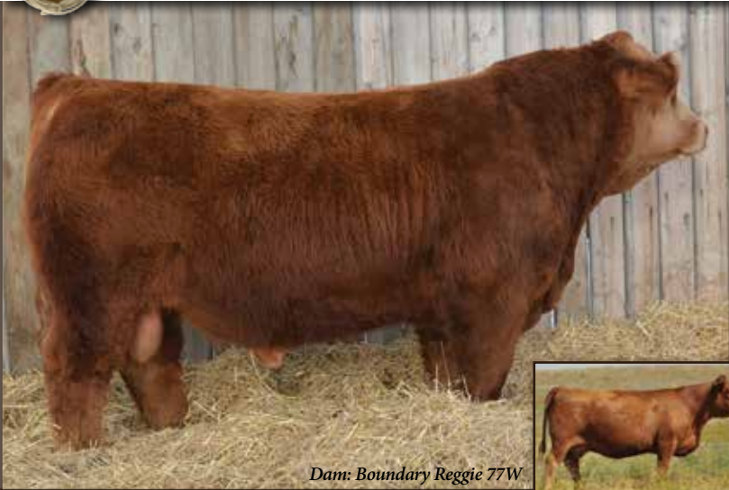
Dam: Boundary Reggie 77W