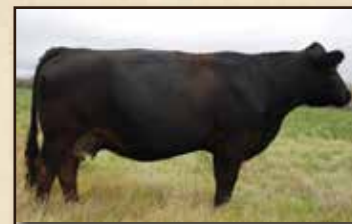
Maternal Sister: Springcreek Lena 138W