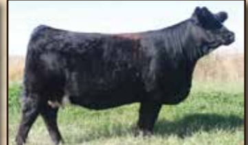
Full Sister to Dam: Sunny Valley Jenna 88U