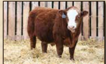
248C from the front