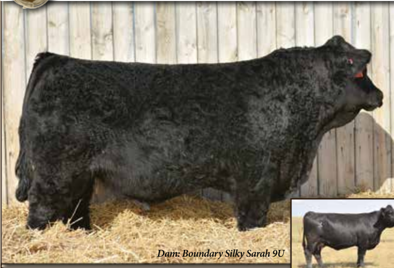
Dam: Boundary Silky Sarah 9U