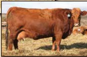
Dam: EDN Label 53W