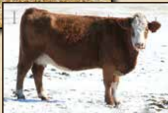
Dam: EDN Puma 99Z