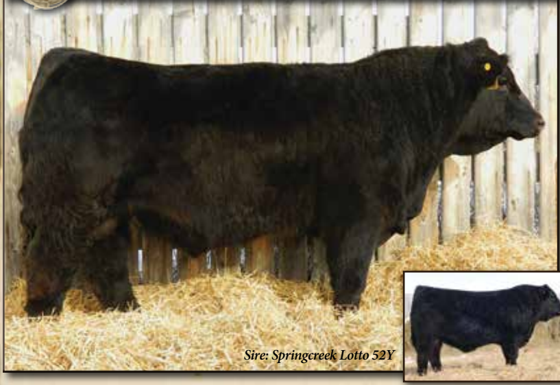
Sire: Springcreek Lotto 52Y

KOP CROSBY 137W S: SPRINGCREEK LOTTO 52Y SPRINGCREEK BLK TESS 25T REMINGTON ON TARGET 2S D: REMINGTON MS TARGET 135U NORTHLAND MISS 036K MUIRHEAD LIVE WIRE 95R KOP MS BENGIE 6P SPRINGCREEK TANK 63P SPRINGCREEK LINNE 71P REMINGTON RED LABEL HR DRAKE SOFT TOUCH 15M CIRCLE S LEACHMAN 600U NORTHLAND MISS 634F