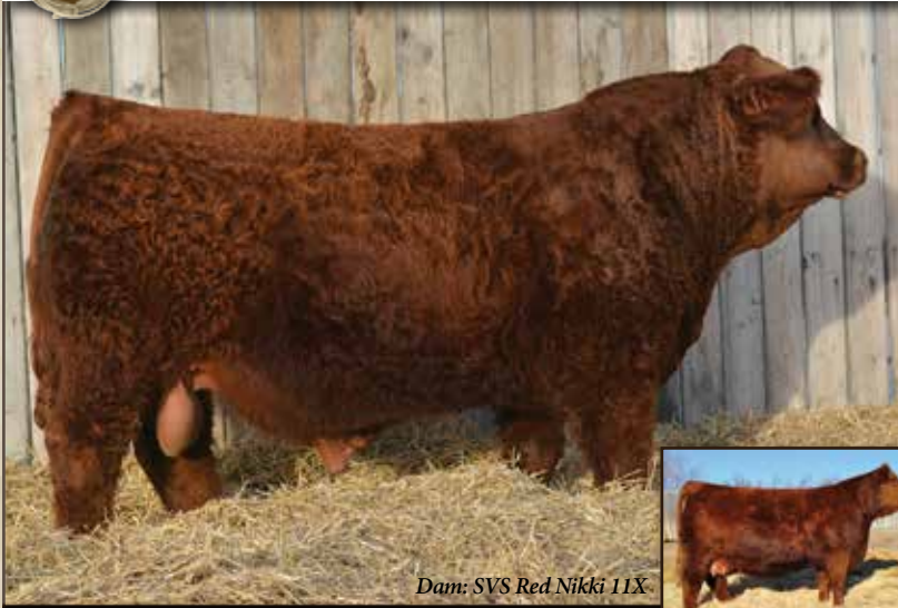
Dam: SVS Red Nikki 11X