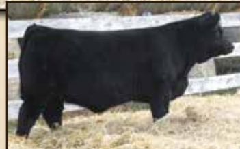
Sire: MRL Tracker 17Z