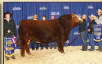
Paternal Brother: KOP Spartan 2015 Agribition Grand Champion