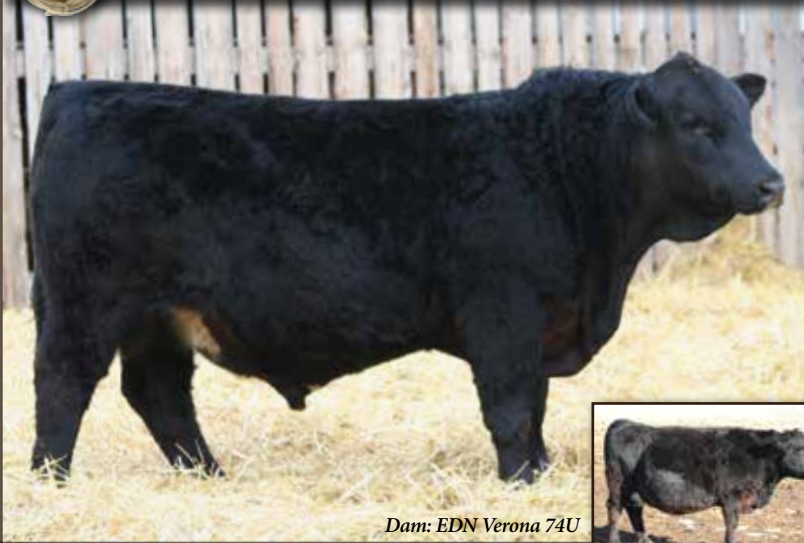
Dam: EDN Verona 74U

S: HARVIE JDF WALLBANGER111X ERIXON PIT BOSS 21Z ERIXON LADY 130U D: SAND RANCH HAND EDN VERONA 74U EDN RAQUEL 37R SHS ENTICER P1B JDF PEPSI 61U COTT-GFI FULLBACK 0038N BAR 40 MS 218M WHEATLAND BULL 131L SAND LUCKY CHARMER IPU BLACK GARRISON 200K EDN MISS 67F