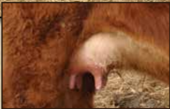
Dam's Udder: Boundary Red Abricot 202Z