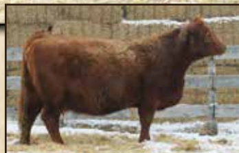
Dam: X-T Red Accer 61X