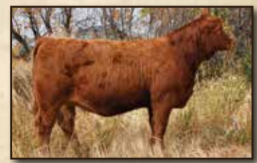
Daughter of Renata 3T: Boundary Renata 42Z