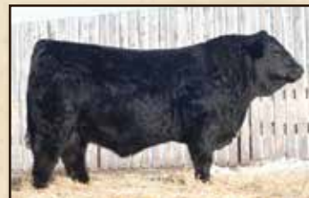
Sire: Springcreek Lotto 52Y