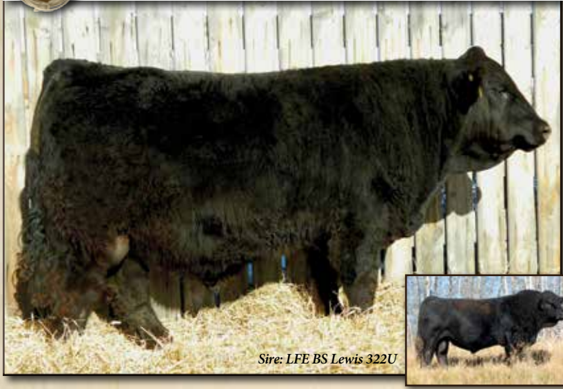
Sire: LFE BS Lewis 322U

R PLUS BLACKEDGE S: LFE BS LEWIS 322U LFE BS MS ARNOLD 135S HOOKS SHEAR FORCE 38K D: TPP CROCUS MS FORCE 25U EDN KAYCEE 19K LAZY S BLACK 29N SUN STAR MISS DRIVE LFE BOMBSHELL 508N LFE MISS ARNOLD 90P NICHOLS BLK DESTINY G151 C&D TRACY ANCHOR "T" METRO 4E EDN HEAVEN 2H