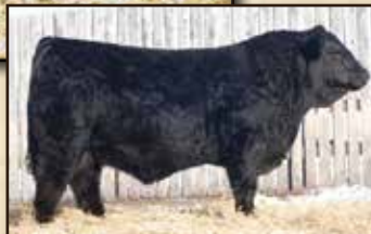
Sire: Springcreek Lotto 52Y