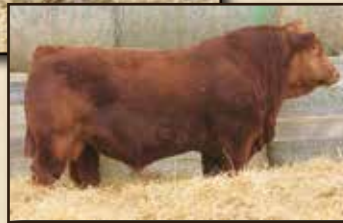
Sire: IPU Red Zone 16A