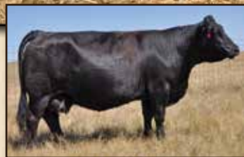
Maternal Sister to Dam: Kimlake Abricot 511R