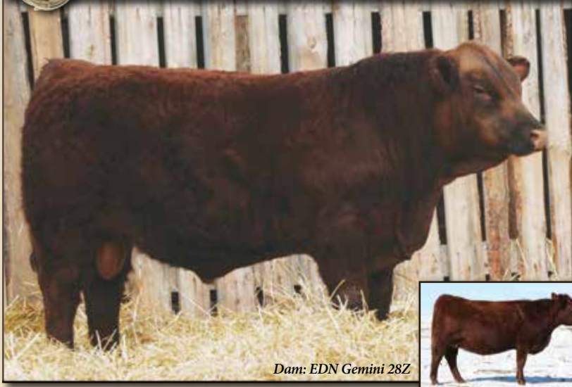
Dam: EDN Gemini 28Z

S: DCR MR MOON SHINE X102 TNT BOOTLEGGER Z268 TNT MISS W70 D: EDN GEMINI 28Z EDN MISS TEXAS 120X R PLUS 7077T DCR MS SHEARCROCK U302 TNT GUNNER N208 TNT MISS S47 DRS J91 OUTBACK 604S RIV RED BRIGADIA 969J VIRGINIA RED TEXAS EDN PENELOPE 14P