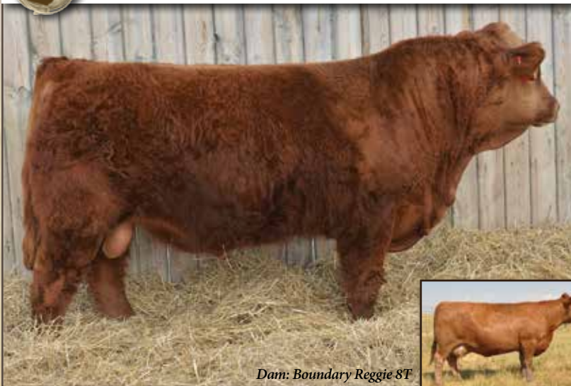
Dam: Boundary Reggie 8T