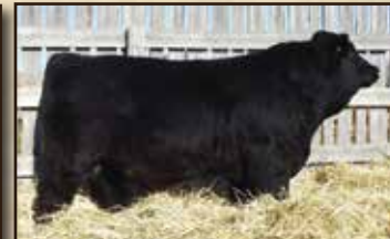
Maternal Brother: TPP 9Y