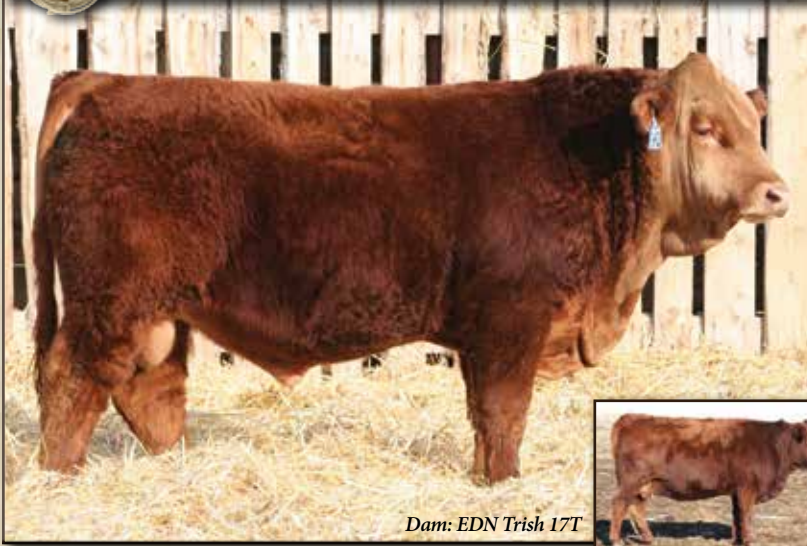
Dam: EDN Trish 17T