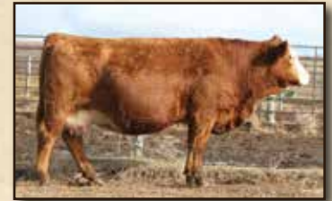
Dam: EDN Bulletproof 160X

HWY 5 TONY 80W S: EDN TONTO 198A EDN STAR 13S LFE BULLETPROOF 439R D: EDN BULLETPROOF 160X EDN STEPHANIE 173S