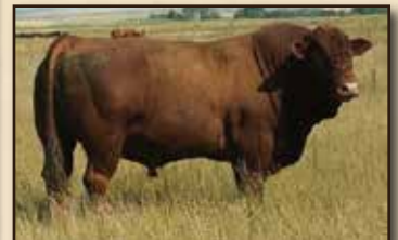
Sire of Lots 18, 19, 20, 33: HWY 5 Tony 80W