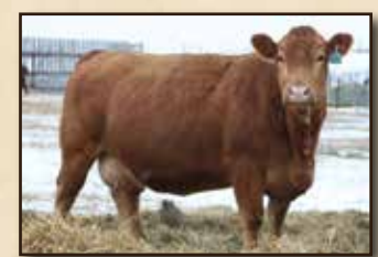
Dam: EDN Truffle 58U

S: HWY 5 TONY 80W SPRINGCREEK BLK TANK 113T SPRINGCREEK TANK 63P SPRINGCREEK PHALTLESS 74N HOOK'S RED QUORUM 55H SUNNY VALLEY LAURA 20L IPU RED NUGGET 132N BAR 15 JET BLACK 1M LCHMN BODYBUILDER 7303F EDN HALLOWEEN 58H D: EDN TRUFFLE 208W EDN VALERIE 58U ERIXON TRADESMAN 17T