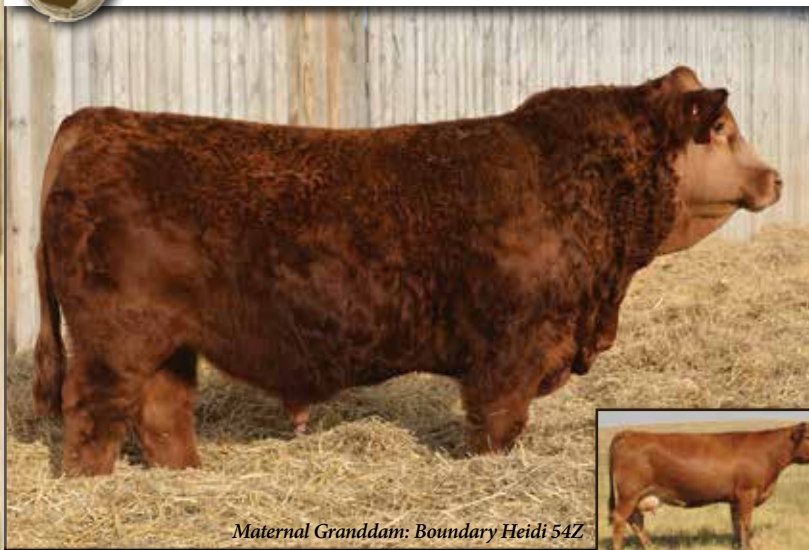
Maternal Granddam: Boundary Heidi 54Z