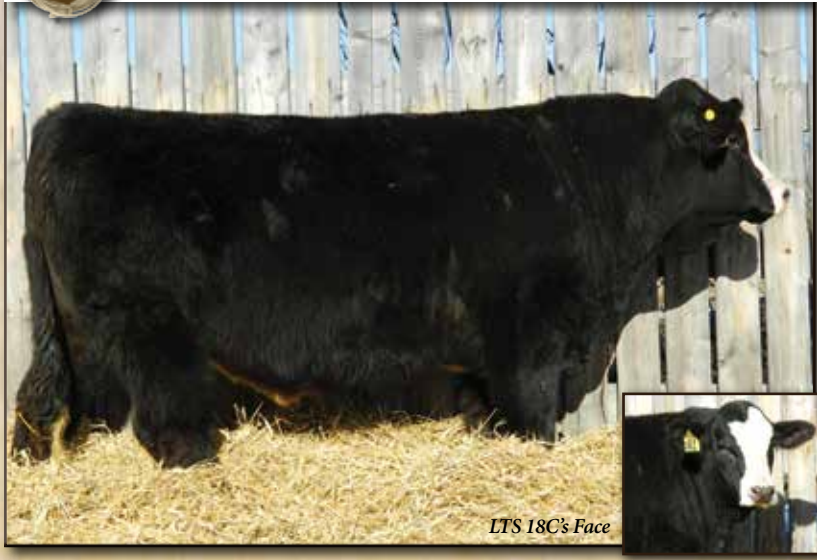
LTS 18C's Face

KOP CROSBY 137W S: SPRINGCREEK LOTTO 52Y SPRINGCREEK BLK TESS 25T REMINGTON RED LABEL HR D: TPP CROCUS MS LABEL 23U TPP CROCUS MISS 66K 22N MUIRHEAD LIVE WIRE 95R KOP MS BENGIE 6P SPRINGCREEK TANK 63P SPRINGCREEK LINNE 71P CNS DREAM ON L186 HS REFLECTIONS J34 SLS KARL 66K TPP CROCUS CARRIE 3L