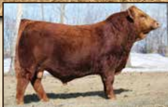
Sire of Lots 66, 67 & 68: NUG Royal Red 324A