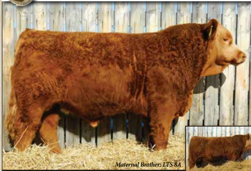
Maternal Brother: LTS 8A