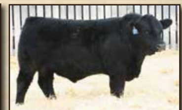
Maternal Brother: EDN 61Z