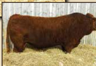
Sire: KWA Amarillo 130Z

TCF/RCC TEMPTATION GJ640 ROCKY HILLS JO SAS/ASF ALL STAR TLR RED DREAM LRS RED REALITY 33J EDN INDIGO 89J DAY GRAND CACHE 792H TPP CROCUS ANITA 23J