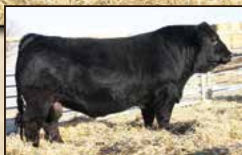
Sire: 3D Blk Full Throttle 483X