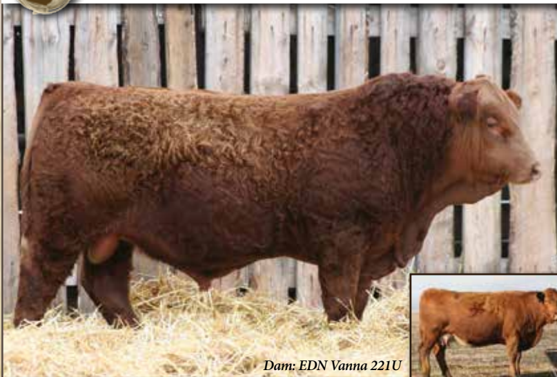
Dam: EDN Vanna 221U