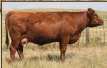
Dam: Boundary Tumbler 15X