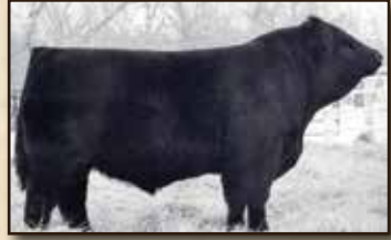
Sire: Wheatland Terminator 202Z